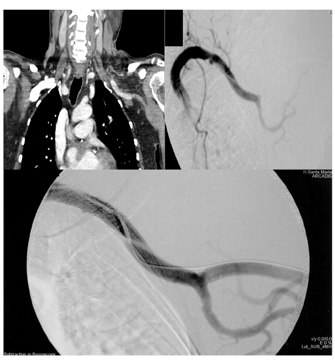
Fig. 1 Case 1. Top left: CTA showing distal extension of dissection to the axillary artery and occlusion of the brachial artery. Top right: Intraoperative selective digitally subtracted arteriography confirming CTA findings, diagnostic catheter placed distally to proximal dissection entry flap. Bottom: Completion arteriography.

diagnostic catheter was positioned in the aortic arch from the femoral access and an endovenous bolus of 5000 units of non-fractioned heparin was given. Mechanical thrombectomy of the brachial artery with a Fogarty catheter under fluoroscopic control was performed, with care not to traumatize the dissected subclavian artery. Subsequently, the dissection was crossed from brachial retrograde access through its true lumen and snared from the femoral access. Finally, one balloon-expandable baremetal stent 10~\text{mm} \times 60~\text{mm} (Assurant® Cobalt Iliac) and one self-expanding stent 10~\text{mm} \times 40~\text{mm} (Complete SE Iliac®) were sequentially implanted at the proximal dissection site and at a secondary distal dissection flap. Completion angiography showed a persistent flow limiting dissection of the distal axillary artery and thus another self-expandable