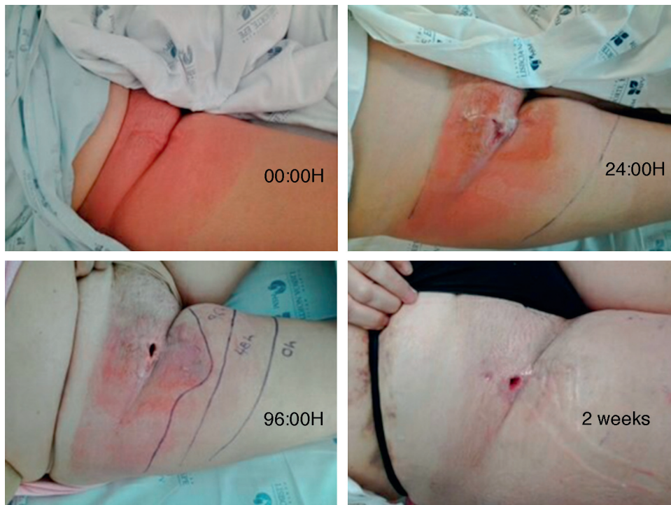
Figure 2 Evolution of groin infection.