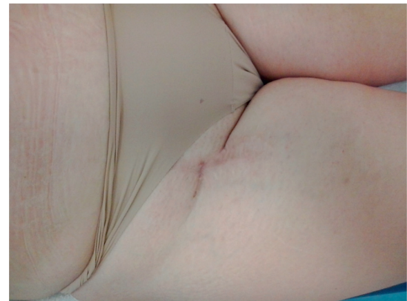
Figure 4 Right groin, 2-year follow-up.

Treatment with abscess drainage, VAC-therapy and oriented bactericide and bacteriostatic antibiotic regimen for S. aureus can be a safe alternative treatment of graft infections with good early results, thus delaying eventually more aggressive surgical treatment.