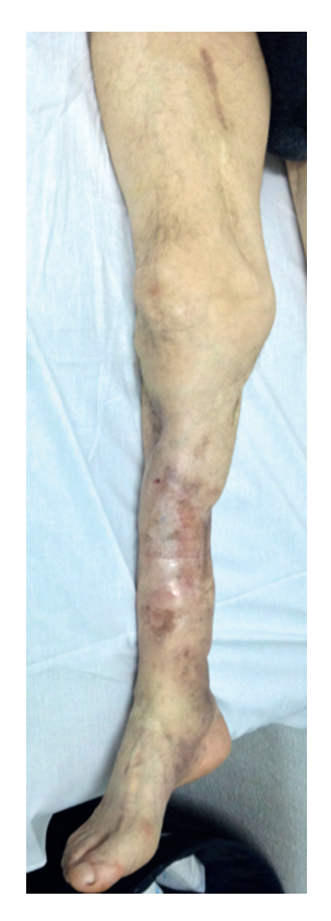
Figure 1 Severely deformed limb with multiple previous fractures, cutaneous grafts, chronic osteomyelitis and complete paralysis of the external sciatic nerve as a sequel of a remote trauma.

The computed tomography angiography (CTA) revealed a roughly 76 mm diameter pseudo-aneurysm of the distal superficial femoral artery (SFA), with mural thrombus and internal calcifications. The popliteal artery was difficult to see due to bone fixation material artefacts. The