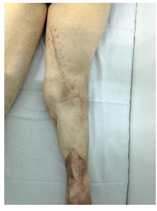
Figure 4 Image after 1 month discharge showing the limb with the proximal extension of the posterior approach.

kind of reaction reported. Therefore Fondaparinux, a factor Xa inhibitor, was used instead of heparin. It is a safe alternative for heparin allergic patients due to its low allergic potential and lack of cross-reaction to heparins.