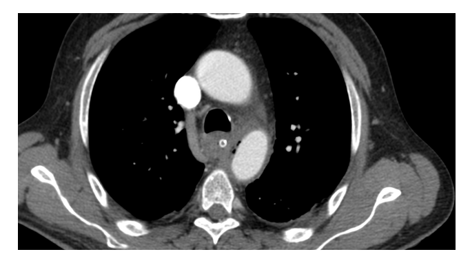
Figure 3 Presence of extra-luminal air bubbles between the aorta and the esophagus.

In these patients there is another challenge, infection. One must consider that infection is, by principle, present in this group of patients<sup>3,4</sup> which makes open surgery and debridement of infected tissues the treatment of choice for these patients. The commonly used technique for open repair of AEF requires left thoracotomy and aortic replacement or even extra-anatomic bypass in cases of serious infection.<sup>5</sup> However, open surgery is related with highmortality rate in this group of patients,<sup>1</sup> although exact mortality rates are not available in literature due to the low number of cases of AEF.