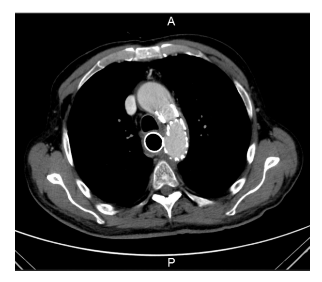
Figure 4 Aortic and esophageal stentgrafts.

This is why endovascular exclusion of thoracic aortic fistulas with TEVAR may definitely have a role, especially in the rapid control of hemorrhage in often physically and physiologically fragile patients.<sup>6</sup>