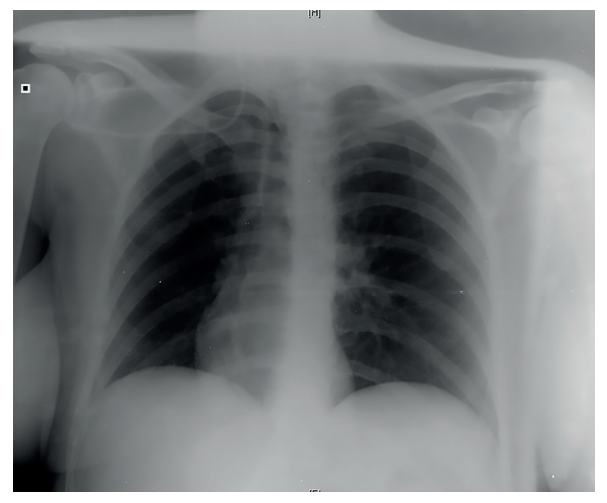
Figure 1 Dextrocardia and CVC tip located in the right jugular internal vein

We are reporting a case of a central vein catheter (CVC) that was inserted at the right subclavian vein, without technical difficulties on a 43 year-old woman. She was admited with an extensive hemoperitoneum, and lost her peripheral venous accesses due to drugs addition. The protocoled chest x-ray showed a previously unknown dextrocardia and the CVC tip was located in the right jugular internal vein (Figure 1).