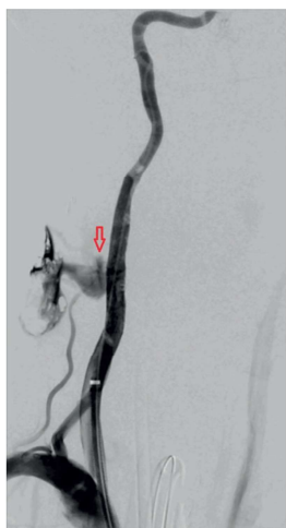
Figure 2 Diagnostic angiography after temporary manual compression relief, revealing active bleeding from the ICA (red arrow); ICA: Internal carotid artery;

A Check Flo sheath (Cook Medical, Bloomington, Indiana) was positioned and afterwards a stentgraft Atrium Advanta V12, (Maquet Getinge group, Hudson, NH, USA) was deployed maintaining ICA patency. (Figure 3)