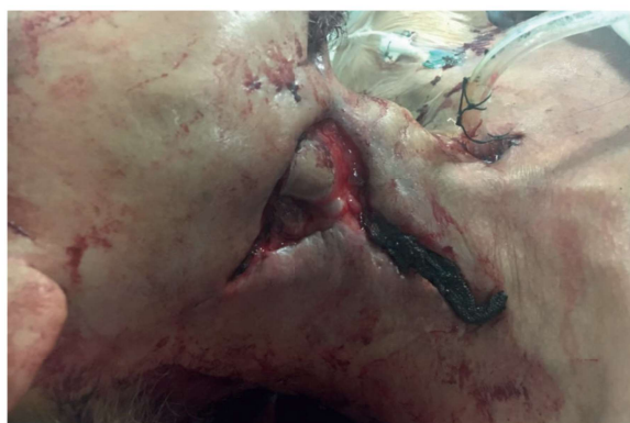
Figure 1 Acute active bleeding from the carotid artery of a patient with osteoradionecrosis of the mandible

The patient is a 61-year-old male with a previous history of head and neck cancer diagnosed in 2010 and submitted to radical surgery and chemo and radiotherapy. Seven years later, the patient was diagnosed with osteoradionecrosis of the mandible and submitted to surgery. However, hospital stay was prolonged due to local infection and suture dehiscence with carotid artery exposure. No previous episodes of sentinel bleeding were registered. Life-threatening haemorrhage from the surgical wound started acutely. (Figure 1) Initially, an attempt to surgically ligate the artery was entertained, but the neck was impenetrable due to fibrosis. Also, the haemorrhage was above the mandible angle, with difficult surgical access.