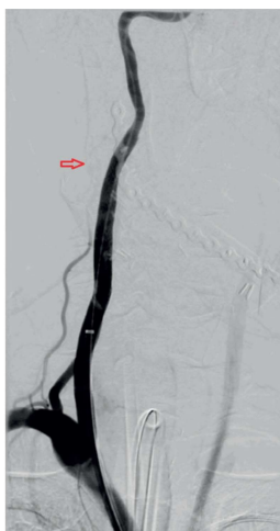
Figure 3 Final angiography after stentgraft deployment with active bleeding resolution (red arrow: stentgraft mesh)

Intravenous cefoxitin and vancomycin were administered before the procedure and maintained for 24h.