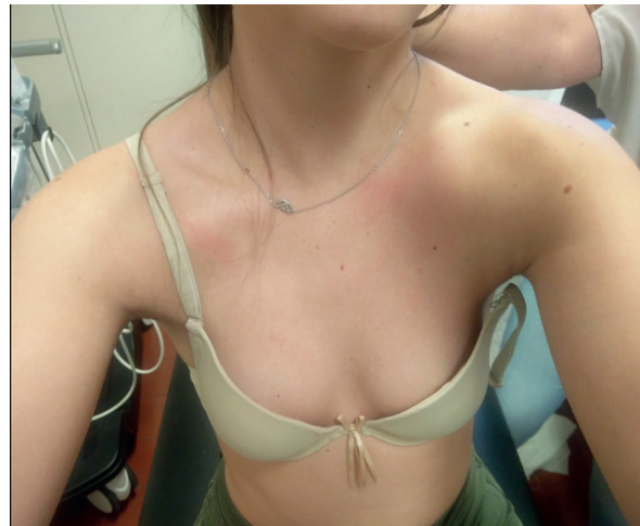
Fig. 1 Visible enlargement on the left shoulder girdle

When large enough, AVMs can cause congestive heart failure and compression of the surrounding (2) . Treatment of AVMs is based on endovascular embolization, surgical resection, or a combination of both. Complete cure is rare, and treatments therefore aim at controlling the vascular anomaly symptoms (1) . The treatment options are conservative measures, endovascular and surgical excision. The endovascular treatment success is based on nidus obliteration (1) . Endovascular embolization can be performed using transarterial, transvenous,