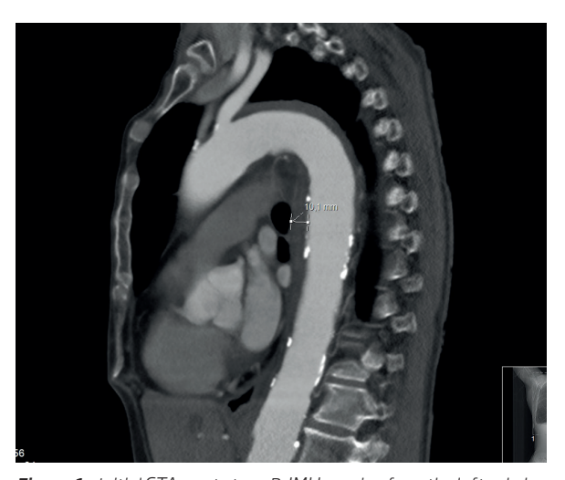
Figure 1: Initial CTA: acute type B-IMH ranging from the left subclavian artery till 5 cm above the celiac trunk, with 10 mm of maximal thickness, no visible intimal tears or ulcer-like projections. Maximal

Control CTA (day 7) revealed no imagiological progression and she was discharged with oral anti-hypertensive medication (consisting of B-blockers and calcium channel antagonists, initiated at day 3 and with controlled BP). Notwithstanding being compliant with medication, at day 16, an intermittent mild thoracic discomfort made the patient seek medical attention. CTA was repeated revealing increased IMH thickness (from 10 to 15 mm) (figure 2). However, after pain control, she was discharged home without vascular surgery evaluation. Despite reporting only very sporadic mild thoracic discomfort, 1-month control CTA revealed not only increased IMH thickness but also progression to an ulcer-like-projection (ULP) with 20 mm diameter and 11 mm depth at proximal third of descending thoracic aorta (figure 3).