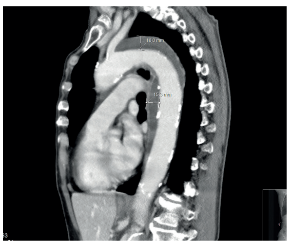
Figure 2: D16 CTA: B-IMH increased thickness (10 mm to 15 mm)