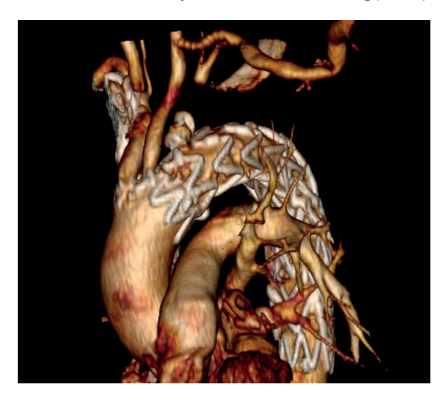
Figure 4: Five months after intervention CTA : correct endoprosthesis placement, without complications

Patient was submitted to left carotid-subclavian bypass followed by TEVAR (Medtronic Valiant® 32×28×150 mm and 28×28×100 mm – oversize less than 10%) and LSA ostial occlusion (Abbot AVP II® 12×9 mm). After endovascular treatment she maintained oral β-blockers and calcium channel antagonists, as well as acetylsalicylic acid and statin medication. During follow-up (5 months), patient reported no symptoms and control CTA showed favorable aortic remodeling (figure 4).