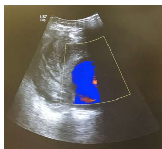
Figure 1 Large heterogeneous tumefaction (77×47 mm) in the distal and posterior thigh. Deep venous thrombosis of the popliteal vein.

A 89-year-old male, with a prior medical history of diabetes, hypertension, bladder cancer, dyslipidemia and smoking was referred to vascular surgery urgency due to a severe swelling and pain in the popliteal space and distal limb edema of the right leg, with some weeks of evolution. The patient did not had peripheral neurological or motor deficits. He was a fragile patient but still autonomous for most of the daily activities. On admission, the patient was found to be hemodynamically stable. The femoral pulses were normal bilaterally, but the popliteal and distal pulses in the right lower limb were absent. He was submitted to a duplex ultrasound – Figure 1 – that showed a large heterogeneous tumefaction (77×47 mm) in the distal and posterior thigh: in the peripheral area predominantly hyperechoic and in central area hypoechoic with the presence of Doppler colour inside, consistent with a large popliteal artery aneurysm. He also presented a deep venous thrombosis (DVT) of the popliteal vein.