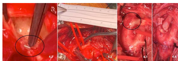
Figure 4. Intraoperative images. Fig. 4.1 Guidewire within the carotid medial wall, in a subintimal plane (black circle, common carotid transverse incision); Fig. 4.2 Guidewire fragment (≈ 7 cm length) after removal; Fig. 4.3: Internal carotid artery pseudoaneurysm (black circle); Fig. 4.4: Pseudoaneurismectomy and ICA end-to-end anastomosis.

A common carotid transverse incision revealed the presence of the wire within the carotid medial wall, in a subintimal plane and the remnant 7 cm fragment was finally withdrawn (figure 4.1 and 4.2). Internal carotid redundancy allowed successful performance of pseudoaneurismectomy and internal carotid artery re-implantation into the bifurcation, with an end-to-end anastomosis (figure 4.3 and 4.4). Patient had an uneventful postoperative course without any signs of perioperative or postoperative myocardial infarction or cerebrovascular events, being discharged at the eight postoperative day. He has now 6 months follow up, without any complications.