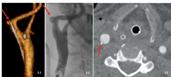
Figure 3. Post-cardiac surgery CTA and angiography. Fig. 3.1 and 3.2: cephalic migration of the broken guidewire; now the remaining 7 cm were entrapped in a tortuous initial portion of the right internal carotid artery. A pseudoaneurysm was visible in the distal portion of the wire (red arrow). Fig. 3.3: CTA, axial view, raising questions about the possibility of the wire being in a subintimal plane.

After pericardiocentesis he was transferred to our Institution for emergent cardiac surgery. Intra-operatively, cardiac surgeons found the guidewire fragment perforating the PDA. When pulling the fragment out, it fractured again and only about 8 cm of the distal portion of the wire were recovered. Transesophageal echocardiography no longer demonstrated the wire in the ascending aorta as seen in the beginning of the procedure. After cardiac surgery and hemodynamic stabilization, a CTA was performed revealing a cephalic migration of fragment: now it was entrapped in a tortuous initial portion of the right internal carotid artery and a small pseudoaneurysm was visible at the distal portion of the wire (figure 3.1 and 3.2). CTA axial views suggested that the fragment might be in a subintimal plane (figure 3.3).