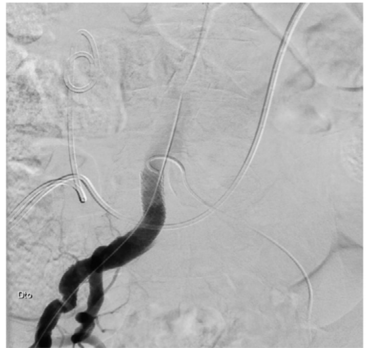
Figure 3. Angiographical image showing placed stent-graft in the right common iliac artery and its intimal relation with the left stented ureter.

Following the procedure, the haematuria resolved, and the patient had an uneventful post-operative stay. A new CTA scan was ordered at 72h hours post-op and showed no signs of early complications.