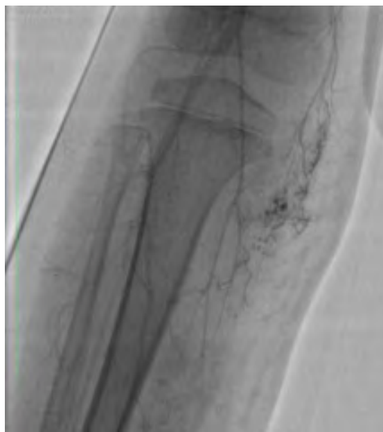
Scarce but diffuse high-flow nidus is noted.

Figure 3. Diagnostic angiography of the vascular malformation