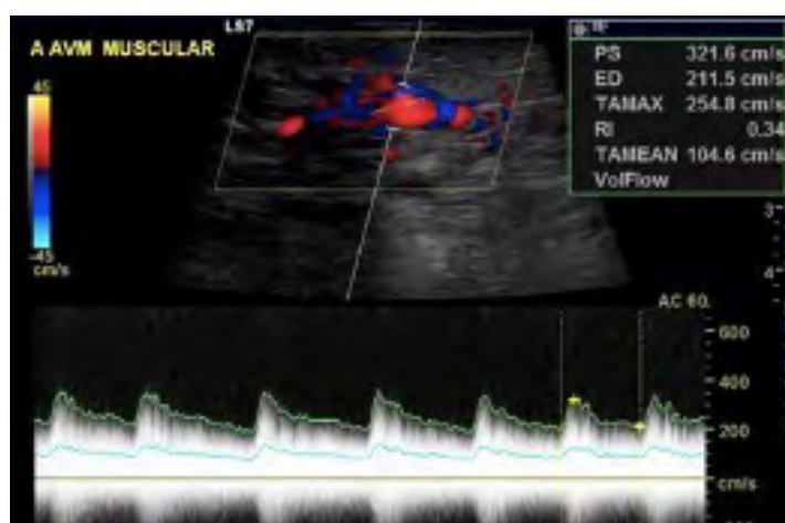
Low-resistance flow in the involved arteries and arterialization of flow in the involved veins is noted, with high peak velocities in both channels.

Figure 2 – Doppler ultrasound of the vascular malformation.