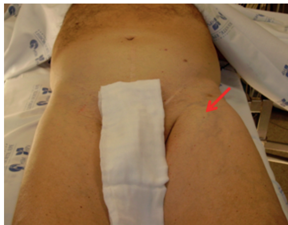
Figure 1 Left femoral pulsatile and expansible mass (red arrow).

On physical examination there was a large pulsatile and expansible mass in the left medial thigh region. The duplex scan examination showed BPFAA with a large left profunda femoris artery aneurysm (PFAA)