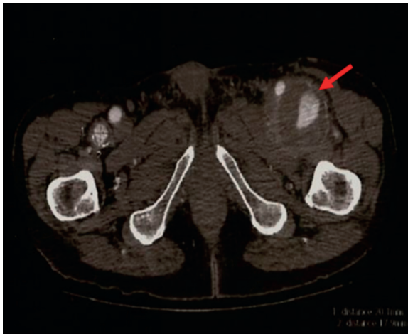
Figure 2 Computed tomography scan showing bilateral profunda femoris artery aneurysm, including a 6 cm diameter aneurysm on the left side (red arrow).