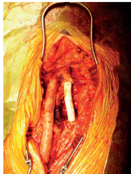
Figure 5 Open aneurysmectomy and polytetrafluoroethylene (PTFE) graft interposition.