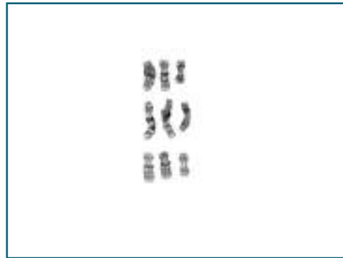
FIGURE 5. Isodicentric chromosome 10p.

detected on a male fetus: hypoplastic nasal bone, nuchal edema, lemon-shaped skull, small cerebellum, bilateral choroid plexus cysts, left hydronephrosis and bilateral clubfoot (shown in Figure 1-4).