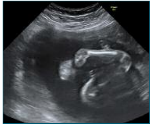
FIGURE 4. Bilateral clubfoot.