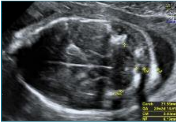
FIGURE 1. Fetal face profile.