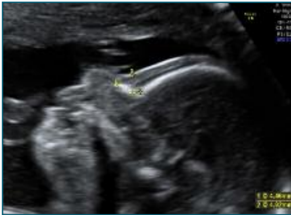
FIGURE 2. Transcerebellar plane.