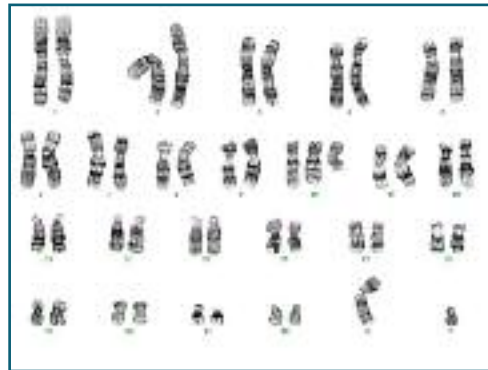
FIGURE 6. Fetal karyotype.

Parental information on the dismal fetal prognosis was given and amniocentesis was performed for cytogenetic study. Fetal karyotype revealed the existence of two distinct cell lines: a line with a supernumerary isodicentric chromosome composed of two short arms of chromosome 10 (29% of cells) (shown in Figure 5); and another line with a normal chromosomal constitution.