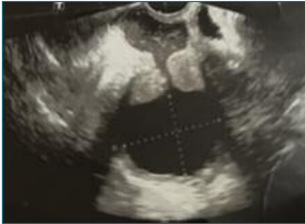
FIGURE 1. Transvaginal ultrasound.