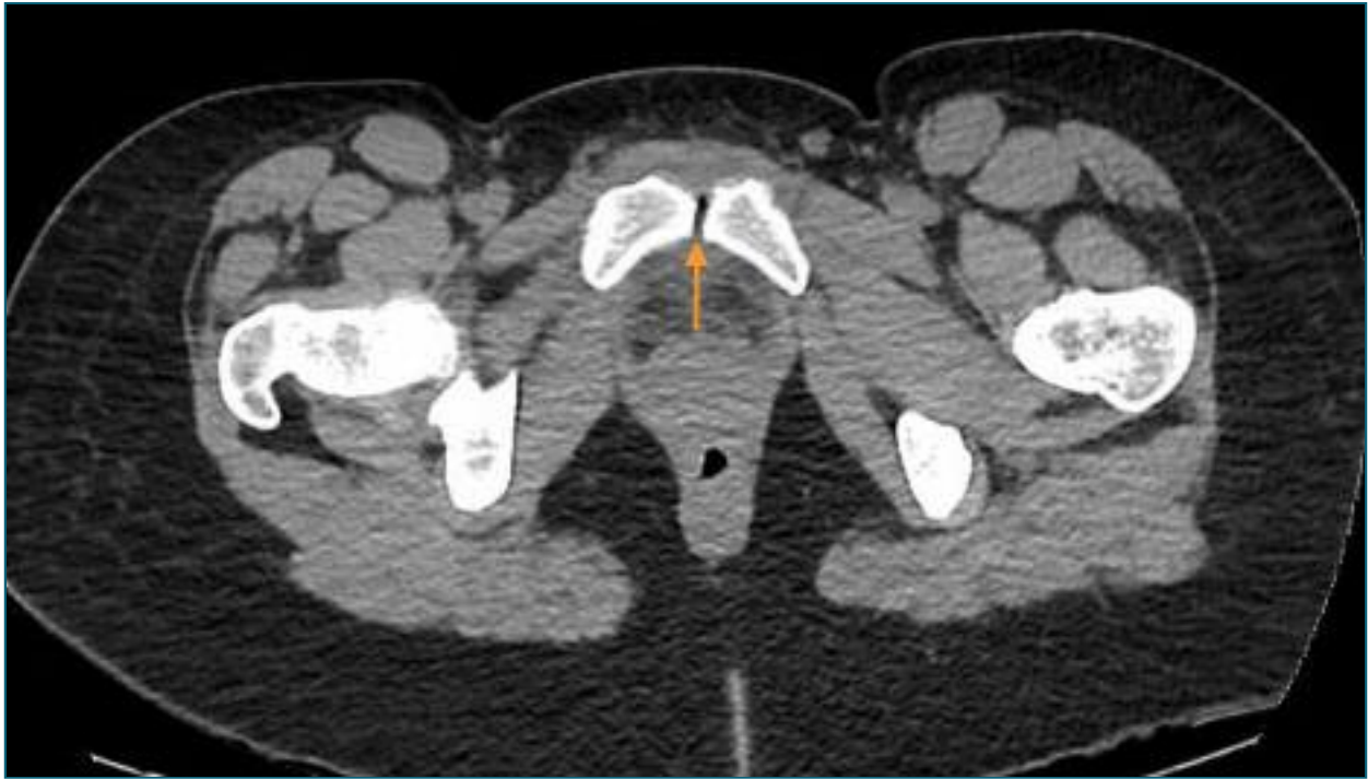
FIGURE 1. Pelvic CT scan. CT scan demonstrating intra-articular air and high density of soft tissues.

pregnancy with a negative swab for Group B Streptococcus at 36 weeks. After six hours of labor without complications, she had a normal delivery of a healthy newborn male with 2500 g, without perineal tears. Two days after the delivery she was discharged denying any symptoms.