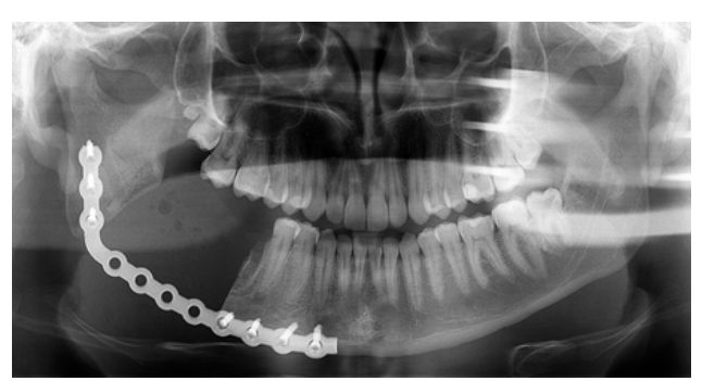
Figure 3 – Orthopantomography after tumor resection with load bearing plate.

Protecção de pessoas e animais: Os autores declaram que os procedimentos seguidos estavam de acordo com os regulamentos estabelecidos pelos responsáveis da Comissão de Investigação Clínica e Ética e de acordo com a Declaração de Helsinque da Associação Médica Mundial.