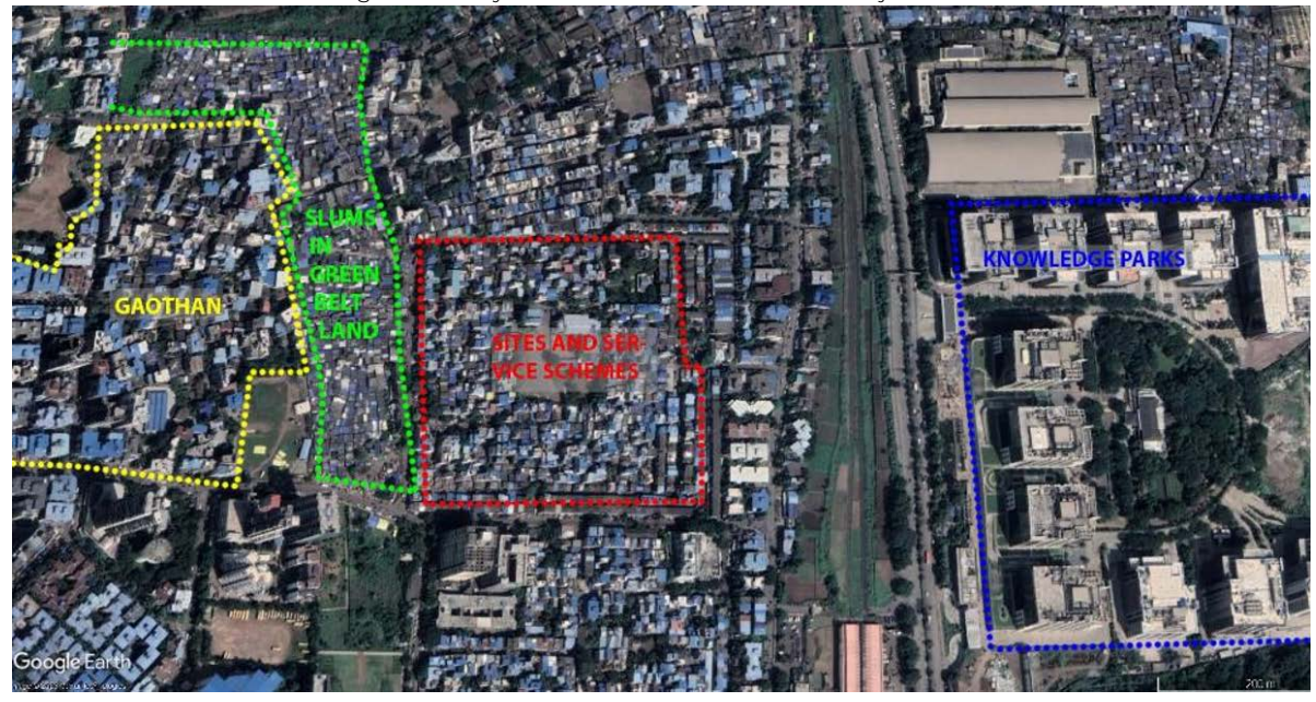
Figure 3. Fuzzy Areas: A cross-section of land adjacencies

In this section, we analyse indigenous and subaltern urban morphologies such as 'slums' and 'gaothans', their positioning within the planned city, and the politics of the respective community's engagement with urban implementation policies causing segregation.