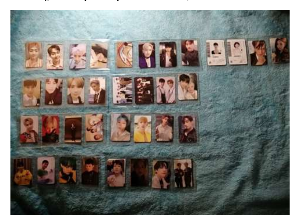
Figure 8. Sample of the photocards collection, from Jéssica Barros<sup>28</sup>

exchange, sale and purchase of these items are encouraged, with the aim of collecting the ultimate bias<sup>27</sup>. Moreover, the preservation of the photocards is also a process that cements the affective relationship that is created between the group and the fan, since there is a preservationist feeling (Heinich, 2010) towards them. For example, they are placed in protective covers and are organised according to certain logics. Even in the sent photographs one can see care and concern regarding the way the items are presented, as they are aligned and within skins. In this way, we can consider that these items are a form of material heritage, although they are not yet recognised as such. An example of this care is the collection of Jéssica Barros, a K-pop fan for eight years. In conversation, she mentioned having in her possession 85 photocards and about 66 albums.