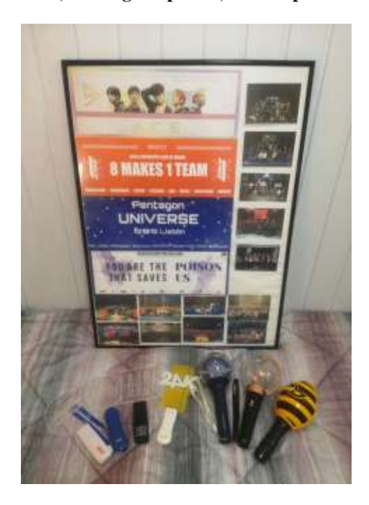
Figure 11. Banners, meet&greet photos, concert photos and lightsticks

Note: Souvenirs of the groups ATEEZ33, VAV34, ACE35, 24K36, PENTAGON37 and BLOCKB38