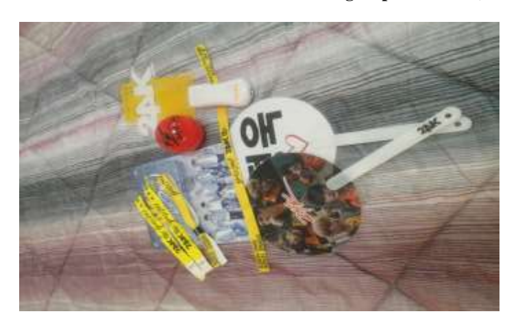
Figure 12. Souvenirs from the two concerts of the 24K group in Lisbon (2017 and 2018)