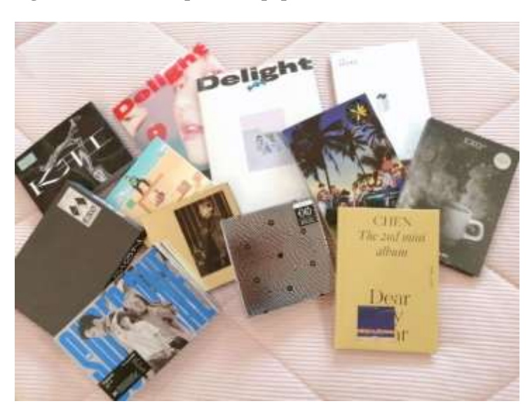
Figure 7. Other examples of K-pop albums, from Érica Oliveira