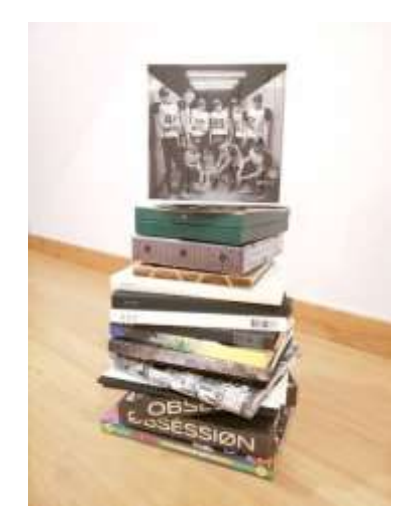
Figure 5. K-pop album collection, from Érica Oliveira<sup>26</sup>