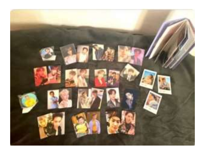
Figure 13. Collection of photocards and a binder with other photocards (exposed ones are the most cherished)