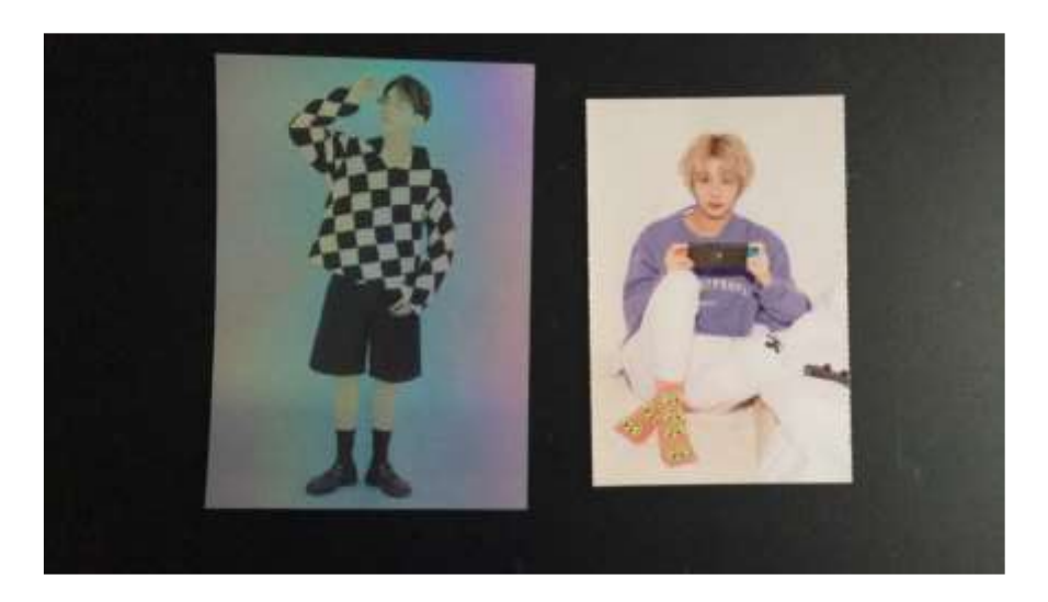
Figure 9. Photocard of Baekhyun from the album Delight and photocard of Hyungwon from 4<sup>th</sup> Fanclub Monbebe