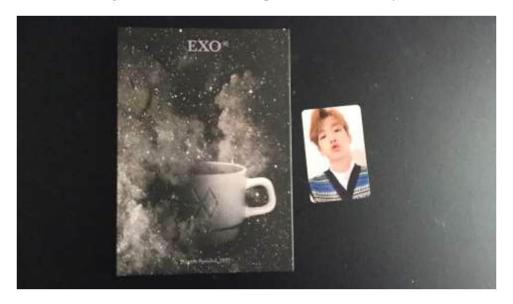
Figure 10. EXO's album and photocard from Baekhyun