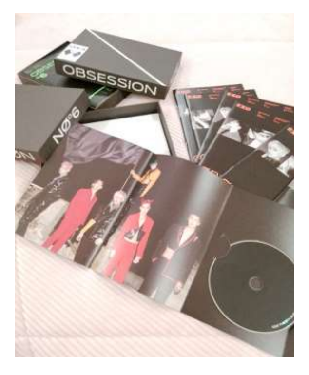
Figure 6. The inside of an album of K-pop group EXO and their photo albums, from Érica Oliveira