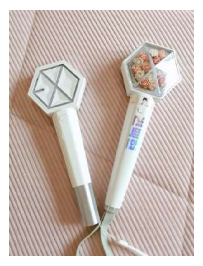
Figure 18. EXO's lightsticks collection, from Érica Oliveira