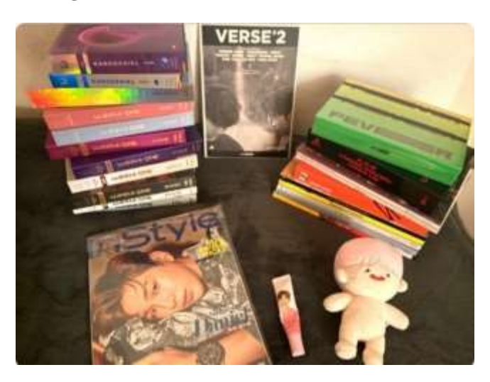
Figure 14. Collection of albums and other items