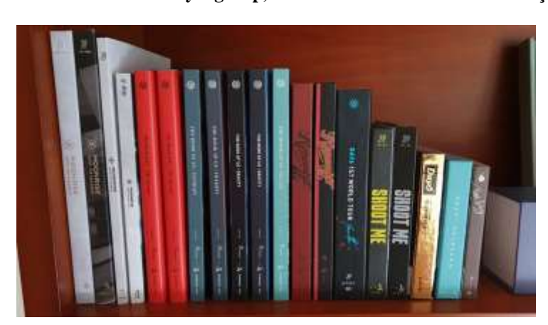
Figure 4. Albums of the Day 6 group, from the collection of Joana Gonçalves

investment and creative work is inside the album and in the other items that accompany it. This ends up being an extremely attractive factor for fans, more specifically the fact that these are not conventional albums, like so many others in which only the cover differentiates them. This is how the individual symbolic value and collective value is created for a certain product within each fandom and, of course, the interaction with the materials becomes an extremely pleasant and sensorial experience, emphasized by the tactile nature of the objects themselves. We thus take into account the construction of an aura as Walter Benjamin (1994) referred which, in parallel, is maintained through the authenticity of the products. Thus, we mean that it is also through the aura of the objects that fans' relationships with the objects are cemented, as well as the need to keep consuming them is maintained, especially by the strong relationship that is created with the source of origin and the image of the product. The aura of these objects conveys a feeling of individualization, as opposed to the idea that they are receiving/buying a mass product (Oliver, 2020). In fact, the very format of the albums comes to ensure the idea that only K-pop fans would be able to recognize and, consequently, acquire them. Thus, this idea also comes to emphasize the special character that fans possess for the promotion of the genre. Here are some examples: