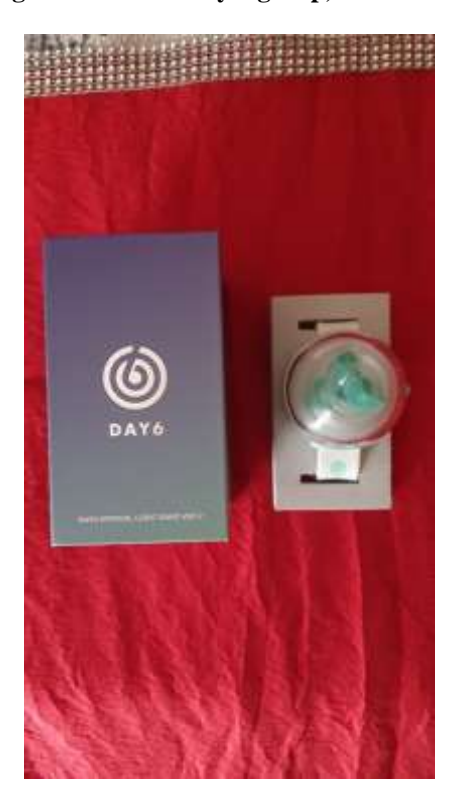
Figure 17. Lightband of the Day 6 group, from Joana Gonçalves