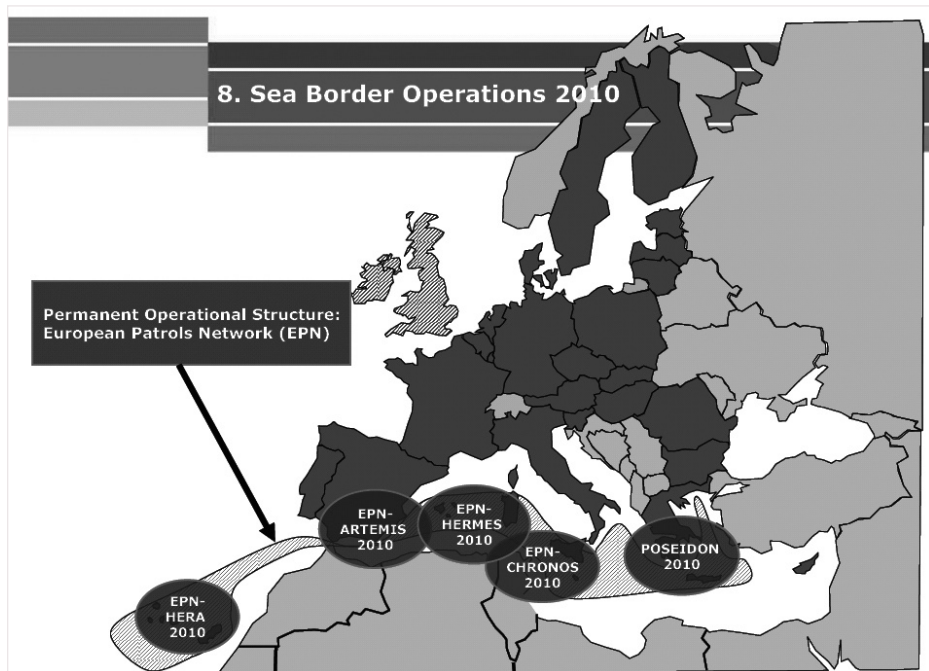
Figure 2: Sea border operations

Though already equipped with extensive material and practical range, this situation does not fit to the ambitious aims of Frontex. In spring 2010 Cecilia Malström, EU commissioner for home affairs, presented a new draft regulation which has since been under discussion (EU Commission, 2010). This new legal framework would enhance the possibilities of Frontex to take initiatives on its own, would stabilise its grip on staff and material, and would extend its competences far into third countries (Monroy, 2010).