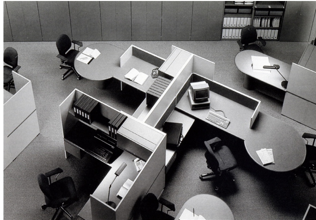
FIGURA 7 Mario Bellini, Pianeta Ufficio desk and office system, Marcatré, 1973-1974, advertising.

Subsequently, with Ettore Sottsass and Michele De Lucchi's Icarus system (Olivetti Synthesis, 1982), the desk responded to the challenge of office automation, i.e. the introduction of computerized systems. The cabling was concealed in a panel-support of the worktop, available in different versions. The desk could be assembled in various configurations (in a cross, in a Y-shape, in an unbroken line), with free and rounded or rectangular end pieces. The colour (grey, yellow, aquamarine) of the terminal elements played a decisive role, because it introduced a variable that could be used to characterize the type of office for which the series was intended. (FIG.8).