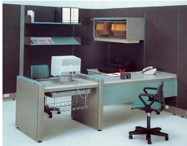
FIGURA 8 Ettore Sottsass and Michele De Lucchi, Icarus desk and office system, Olivetti Synthesis, 1982, advertising.

Subsequently, with Ettore Sottsass and Michele De Lucchi's Icarus system (Olivetti Synthesis, 1982), the desk responded to the challenge of office automation, i.e. the introduction of computerized systems. The cabling was concealed in a panel-support of the worktop, available in different versions. The desk could be assembled in various configurations (in a cross, in a Y-shape, in an unbroken line), with free and rounded or rectangular end pieces. The colour (grey, yellow, aquamarine) of the terminal elements played a decisive role, because it introduced a variable that could be used to characterize the type of office for which the series was intended. (FIG.8).