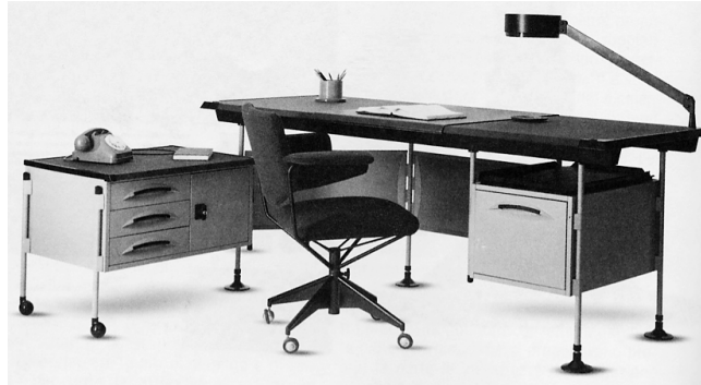
FIGURA 5 BBPR, Spazio desk, Olivetti Synthesis, 1960-1961, advertising