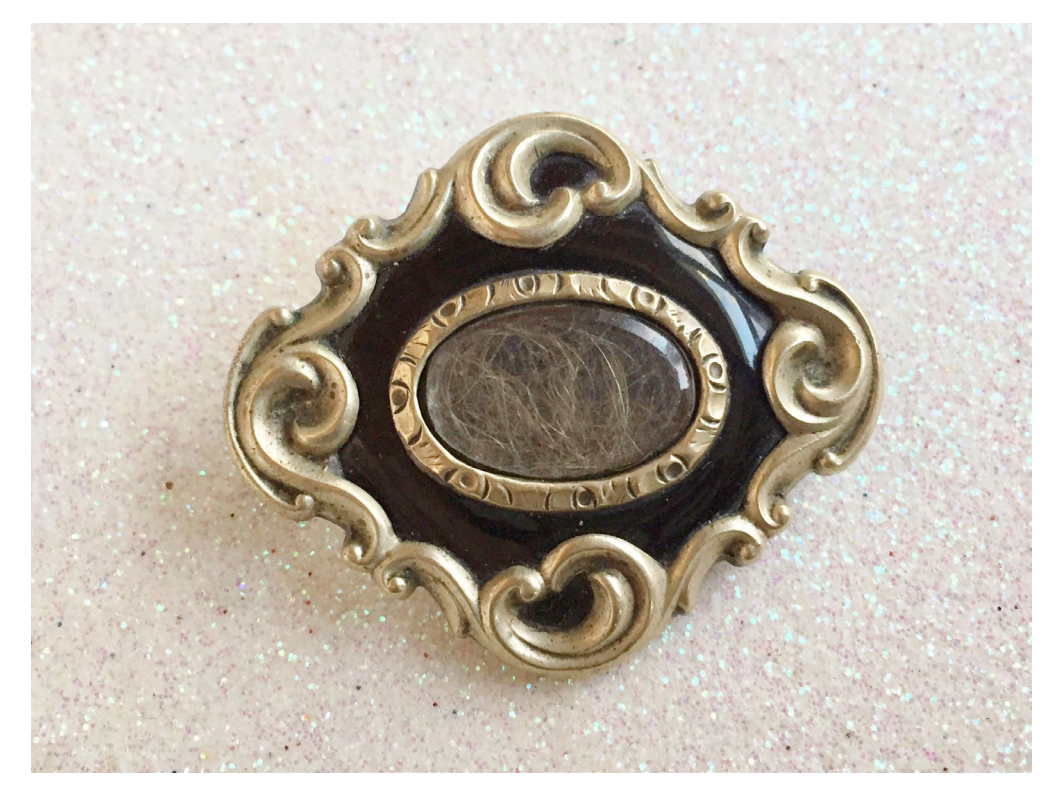
Fig.7 Mourning Victorian brooch. Hair, with gold and black enamel. Original midVictorian era mourning brooch with hair, 1860's.

The rest of Victorian mourning jewelry was both vast in variety and exciting in forms and symbols. As in Georgian times, many items incorporated human hair; in this case, though, hair was used more intensively and in many different ways, as its application became the latest word in fashion after Queen Victoria's decision to always keep a locket with a lock of hair of her late husband Albert. Thus, bracelets, rings, but mainly pendants, brooches and lockets incorporated more and more hair of the deceased loved ones, however in more perplex and elaborate forms and designs, than in the case of Georgian objects.