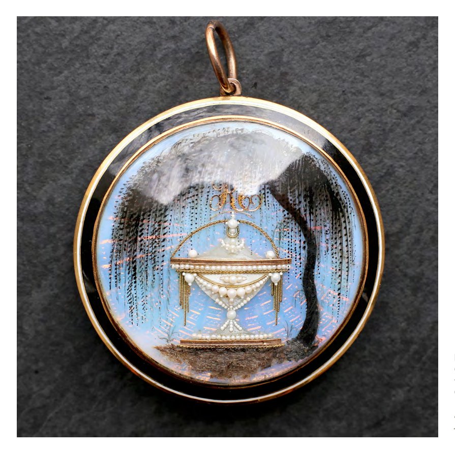
Fig. 3 Georgian mourning pendant with urn and weeping willow. Gold, glass, paint and pearls, 1800

Neoclassicism as an ideological and artistic movement born after the excavations in Pompeii and Herculaneum in the mid-eighteenth century was an important source of inspiration for the broad thematology of memorial jewelry which started gradually being adorned with the ancient symbols of victory, triumph, but also of burial ceremonial traditions (Bietoletti, 2005, p.10) [9]. Most important of all was probably the urn², a type of ancient elegant lognecked vase covered with a lid, which had a dominant role in both the social and cultural traditions of the ancient Greeks and Romans. Nevertheless, its roots go back to European and Asian cultures of prehistoric times, when people used it as a food storage container, but also as a burial vessel.