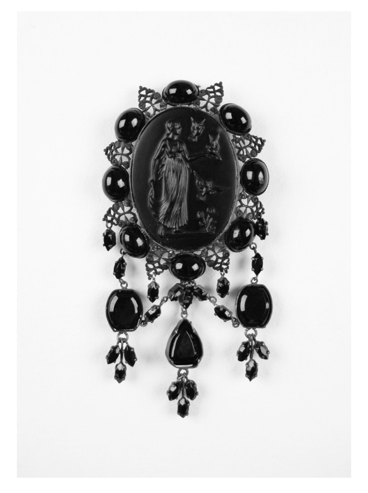
Fig. 6 1870's impressive Whitby Jet mourning brooch.