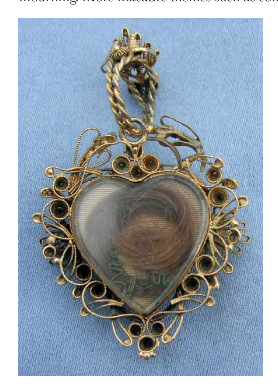
Fig. 2 Georgian gold mourning pendant in a heart shape with golden wire, glass and human hair, 1795.

Their most popular themes-symbols were taken from the then topical Neoclassical movement, such as the ancient urns, the eye portraits<sup>1</sup>, the classic symbol of the heart, but also that of the weeping willow, the tree that was directly associated with the primordial sense of mourning. More macabre themes such as coffins and tombs were also popular.