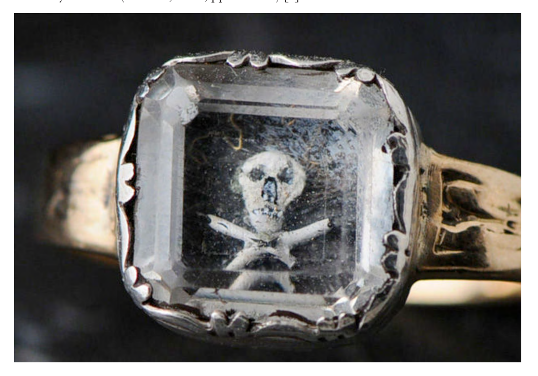
Fig. 1 Gold and silver Memento Mori ring with a skull, late eighteenth century.

There was little influence from the aesthetic style of the new French fashion, but also of any fashion that had preceded it, the mourning jewelry, mainly rings and pendants, known as Memento Mori or else Remember you will die , that is a particularly hard but truthful statement that reminded to the beholder the inevitability of death. These jewels, which usually bore this Latin phrase engraved on some part of their surface or contained elements strongly associated with death such as designs or forms of human skeletons or parts of them and even skulls, had their roots in the medieval tradition, while they were never meant to commemorate a person, in particular. According to medieval religious stereotypes, people should always have in mind the Divine Judgment, Hell, the importance of Forgiveness and Salvation, but also the Vanity of worldly life and to reconcile, even subconsciously, with the certainty of death (Braaten, 2011, pp.582-583) [6].