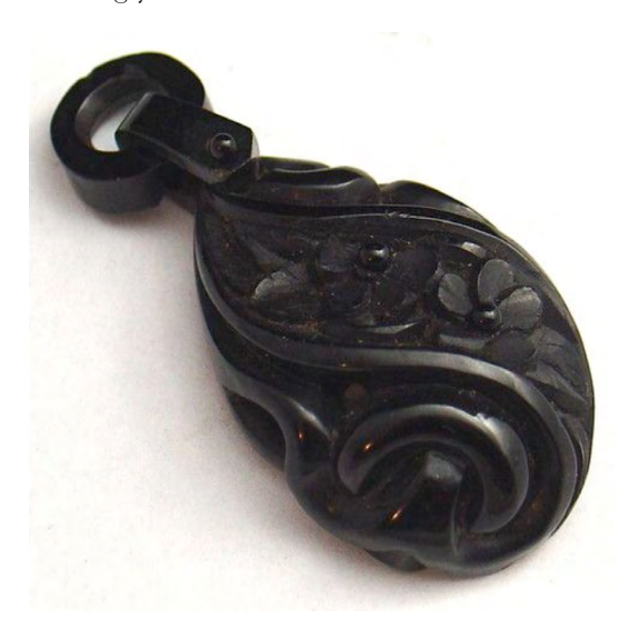
Fig.9 1870's Victorian Whitby Jet mourning pendant with forget-me-not flowers carved on it.

Flowers were closely associated with Victorian culture and were frequently used as popular decoration patterns adorning almost everything from wallpaper, clothes and frames to Valentine cards, book covers, furniture and metalwork. So it is not surprising that the language of flowers constituted a dynamic part of Victorian mourning jewelry symbology, which, however, needs to be interpreted accordingly.