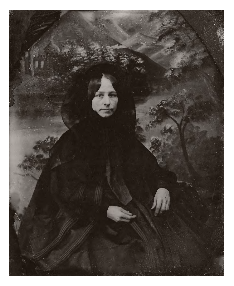
Fig. 5 Victorian widow in mourning in 1860s, daguerreotype technique.

During that new period, the traditional custom of mourning began to change, becoming more stringent and demanding. For females, who constituted the stereotypical characters in mourning rituals, the period of mourning was divided into three phases: full mourning, second mourning and finally half mourning.