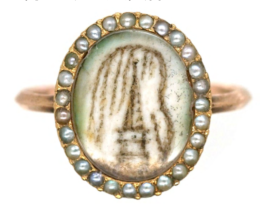
Fig. 4 Georgian mourning ring depicting an obelisk monument with a weeping willow tree. Gold, pearls, ivory, glass, early nineteenth century.

A very popular symbol on gravemarkers, tombstones and cemetery headstones in the early 1800s during the long neoclassical period, especially during the Greek Revival time, was the weeping willow tree (Dethlefsen, 2005, p.504) [10].