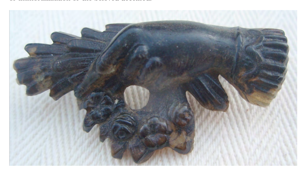
Fig.8 Hand holding a flower wreath. Gutta-percha mourning brooch, 1880's.

The hand was a very popular symbol, especially in the 1870s and 1880s, and was usually depicted on Jet, vulcanite and gutta-percha brooches, rings and pendants. As a specific, repetitive design of a female hand holding either individual flowers or a wreath of flowers, symbolized the power, the faith, the offering, the protection, the divine acceptance, and the good relations that mortals should have with the Heaven, which should constitute their final destination. The hand was also linked with the idealization concept, but also with that of immortalization of the beloved deceased.