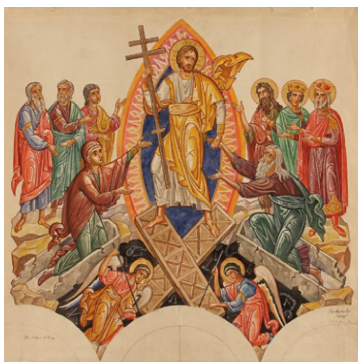
Fig. 1 “Resurrection” mosaic project drawing

S. Hordynskyi’s monumental mosaics resembled the best examples of Ukrainian folk art in their colouring, and their design was influenced by modern Western art schools. The author develops the mosaic space from a system of characteristic micro-spaces united by the wall plane into a single unit. This combination of different images necessitates the division of the mosaic space into conditional registers, developing them from a combination of different scenes, what can be seen in Figure 1.