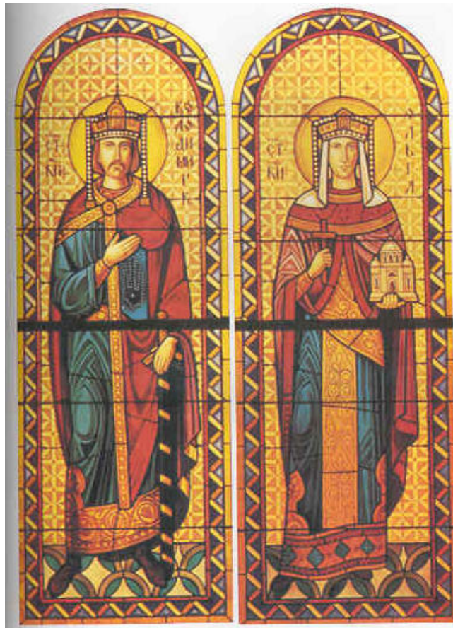
Fig. 3 Mosaics of Saint Volodymyr and Saint Olha from the St. Sophia Cathedral in Rome

Inspecting the churches of Greece, Italy, and the Mediterranean countries, the artist realised that each era and each culture designed its vision of space and developed a method of plastic expression appropriate to its ideas. Thus, the Byzantine medieval culture established its specific understanding of pictorial space and form. In Byzantine space, everything depicted is both a specific object and a space for another object. The mosaics of Saint Volodymyr and Saint Olha in St. Sophia Cathedral in Rome exemplify this concept (Figure 3).