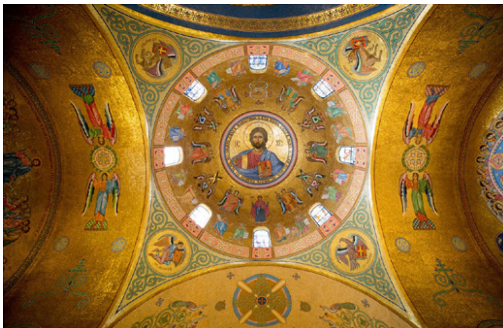
Fig. 2 “The Wisdom of God” in St Sophia Cathedral in Rome

The artist uses the method of generalisation and symbolisation to convert a complex theological worldview into the language of plastic painting. The mosaic “The Wisdom of God” in St Sophia Cathedral in Rome (Italy) seems to emerge from the wall by increasing circles, ovals and geometric lines, defining its clear linear-spatial structure, and the technique (or manner) of rounding the forms, bringing them to the correct geometry, allows the artist to achieve a certain sculptural character of the images (Figure 2).