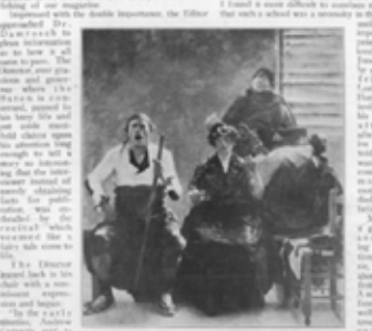
Fig.9 The Baton, Vol. III – No. 4, January 1924