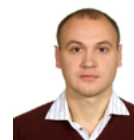
BOHDAN KYSLIAK 2

Project administration, Writing - Original Draft, ORCID: 0009-0007-6308-5362