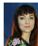
OLHA MOSKVYCH 3

Conceptualization, ORCID: 0000-0001-6964-7863