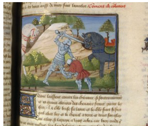
Fig 8. (Right) The Battle of Lancelot and Margond. Source: François 111, fol. 131, BnF (Bibliothèque Nationale de France, 2021) [24].