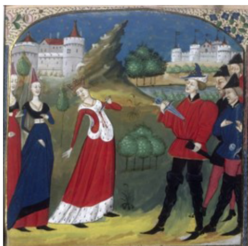
Fig 15(Right). Hannibal's Suicide, Source: Français 226, fol. 140v, BnF (Bibliothèque Nationale de France, 2021) [24].