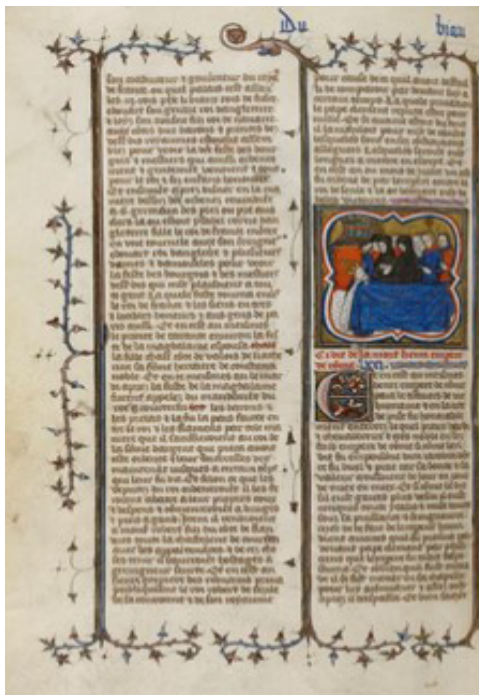
Fig 5. (Left) The death of Henry VII, Source: Français 10135, fol. 391r, BnF (Bibliothèque Nationale de France, 2021) [24].

Lords, rulers, kings. Medieval culture is also described by the sacralization of the ruler's image. Among the miniatures that unfold the theme of death, images of the King on his deathbed are extremely widely represented, the transition to eternal life has a symbolic meaning and should take place solemnly and publicly. Miniatures depicting the deaths of kings and rulers, historical characters, literary heroes, and contemporaries are quantitatively represented in the Gothic illumination most fully. In Gothic iconography, which went through several consecutive stages of development during the 13th-15th centuries, various variants of depicting the death of monarchs are known. But there are sustainable components that miniaturists invariably use in both early-Gothic samples and late-Gothic miniatures. The ritualized imagery of death, which combines the discourse of sacralization of the religious worldview and sacralization of the monarch's power, has a stable iconographic model of a representative static nature. The ruler who dies is most frequently depicted lying on a bed and there are always those present next to him. In early iconographic versions, these are one or two characters, and the specifics of late Gothic illumination involve mainly a multi-figure composition (Fig 5), in the XV century often quite detailed (Fig 6).