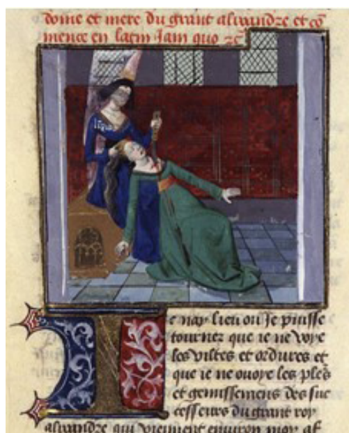
Fig 11. Olympias kills Cleopatra’s daughter.

Medieval miniaturists depicted not only women who die, but also women who kill. An illustration depicting the death of a Macedonian Princess, Cleopatra’s daughter, at the hands of a jealous and vindictive rival Olympias (both were wives of Philip II) combines these iconographic motifs (Fig 11).