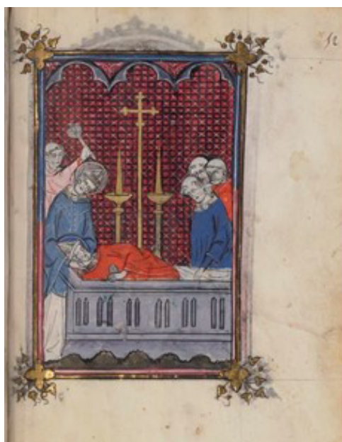
Fig 3. (Left) Burial of Saint Santin, Source: Français 13502, fol. 52, BnF (Bibliothèque Nationale de France, 2021) [24].

The miniature depicts the funeral of Saint Santin, a French bishop and missionary, a disciple of Saint Denis (that is why this illustration is placed in the life). The miniature represents a beautiful version of high Gothic with its inherent features: the composition is subordinated to architectural and tectonic elements, the figures get free from static and acquire linear flexibility, they lengthen, the interpretation of poses and gestures is expressed, although the attraction to applicativeness, theatricality, and convention is still evident, and it is thanks to this that the organic connection of the characters with the wallpaper background and schematically depicted objects of the entourage is preserved. The combination of several points of view is also an inherent feature of medieval painting up to the beginning of the 16th century. In the illustration, Saint Santin is depicted in the image of a contemporary Bishop with all the attributes, the entourage is also appropriate. One of the miniatures depicts the death of Saint Joseph of Arimathea, he is also depicted as a medieval bishop, whose body is laid on a conventionally presented hearse, surrounded by angels with censers performing a funeral rite (Fig 4).