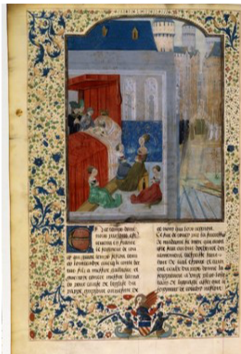
Fig 6. (Right) The death of Edward III, Source: Français 87, fol. 344v, BnF (Bibliothèque Nationale de France, 2021) [24].

Thus, this iconography belongs to representative models, and is associated not so much with the plot and action, which unfolds through a visual narrative depicting circumstances and details, but with the symbolism of an image that acquires a cult status. The compositional structure here is based on visual parallelism with images of a religious circle, for example, with the scene of the Assumption. This practice of constructing a visual narrative was well-established among medieval miniaturists of the late Middle Ages, and the mechanism of adaptation of compositional solutions was used rather frequently. For example, among the typical scenes for courtly novels are images of feasts and regales, a well-established iconographic scheme was developed for it, related to sacred iconography, namely with “marriage in Cana of Galilee” (Hrynda, 2021) [19].