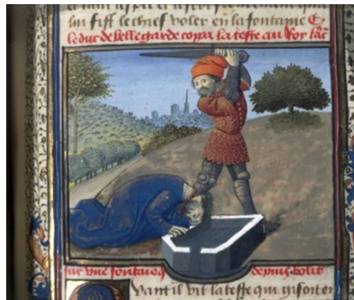
Fig 12 (Left). The Murder of Nectanebus.