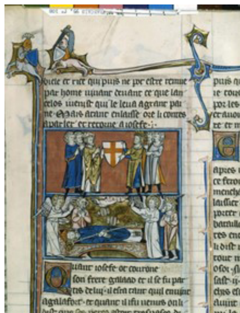
Fig 4. (Right) Burial of Joseph of Arimathea, Source: Français 95, fol. 108, BnF (Bibliothèque Nationale de France, 2021) [24].

The Hand of the Lord extends from heaven to Joseph, testifying to the highest level of holiness and importance of the image. Medieval miniaturists also depict the death of Saint Arsenious, who became a model for hermit monks, according to the ideas about the canons of the transition to eternity of a pious Saint – peaceful, with a blissfully detached expression on his face. Next to the deathbed of the Saint, depicted in the Episcopal tiara, stands a young monk who witnessed a significant event. Significant, because in relation to Saints in the Middle Ages, death was considered a sacred act, and its fact was recorded and revered, more than the day of the Saint's arrival in the world, as evidenced by hagiographies that call the date of death, not the date of birth.