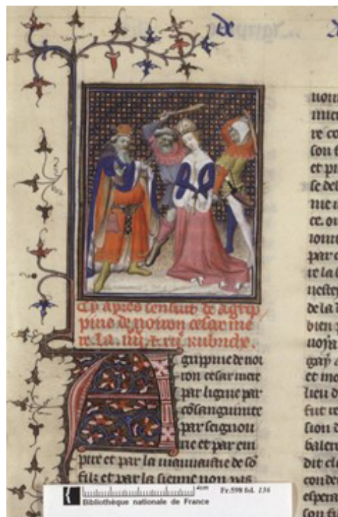
Fig 9(Left). The death of Dame de Béléoé.