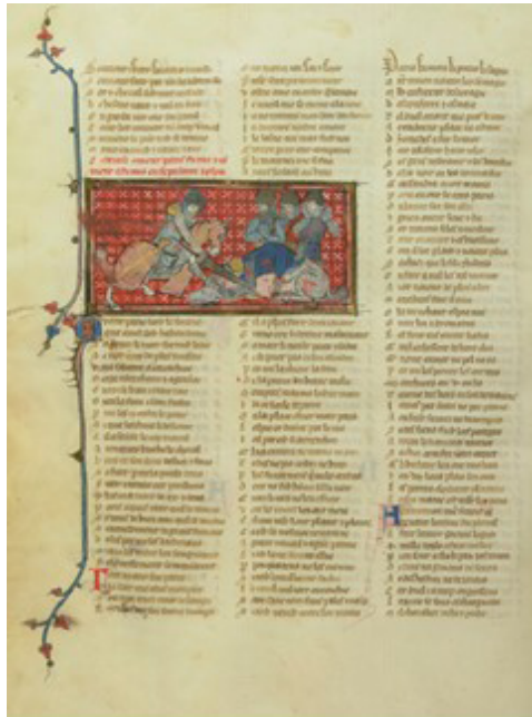
Fig 7. (Left) The Death of Paris, Source: François 60, fol. 119v, BnF (Bibliothèque Nationale de France, 2021) [24].

historical Bibles) and secular ones (historical chronicles, treatises). The specific features of depicting death on the battlefield are radically different from ceremonial, representative compositions with scenes of the death of Saints, clergymen, and kings. Death in battle is honorable, and a warrior should accept it fearlessly and courageously. A widespread iconography of death is when a knight leans towards his horse from a death blow with a sword or spear (in Gothic illumination, images of horse duels and battles clearly prevail) (Fig 7) (François 12565, fol. 155v; François 60, fol. 119v) (Bibliothèque Nationale de France, 2021) [24].