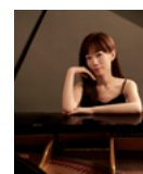
LU AN 4