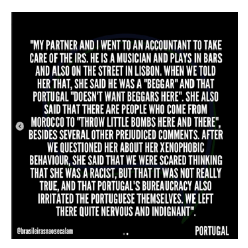
Figure 4 Instagram post @brasileirasnaosecalam

Within that category, and based on the Lusotropical premiss, we decided to postulate a branch of that area, for as Lugones (2008) reminds us, "race is neither more mystical nor more fictitious than gender — both are powerful fictions" (p. 93). Racism was described in six of those posts, which corroborates the view of Padilla and Gomes (2016) when they conclude that the principle of Portuguese non-racism cuts across the whole of society.