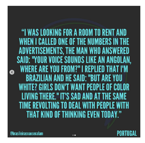
Figure 5 Instagram post @brasileirasnaosecalam

The latest data from the European Social Survey (n.d.) of 2018/2019 stem from this view, showing Portugal as one of the most racist countries in Europe. The study investigated the presence of biological and cultural racism in the country, and it found that racist inclinations were stronger in older and less educated individuals. 62% of the respondents showed racist behaviour, while only 11% completely disagreed with racism. In other words, according to this research, one in three Portuguese people affirmed racist beliefs, as illustrated in Figure 5.