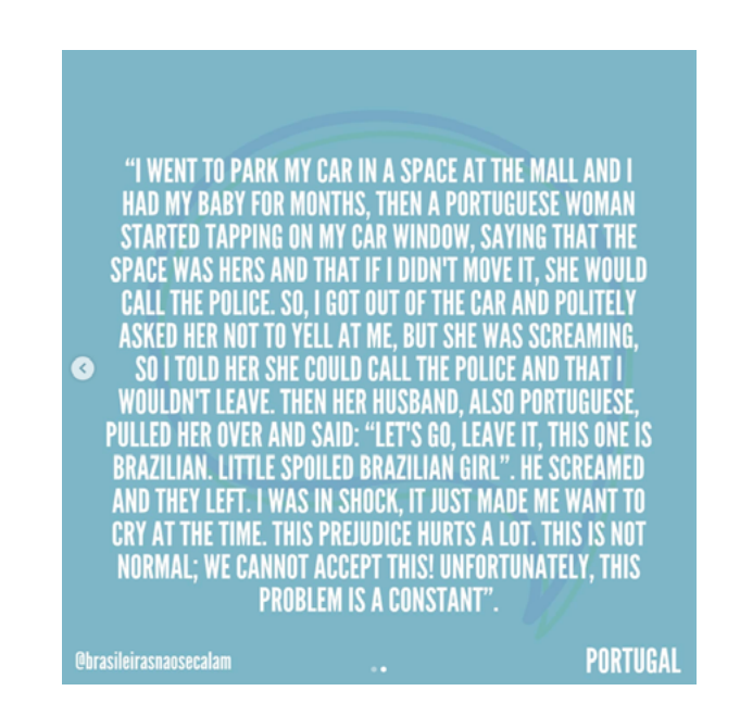
Figure 3 Instagram post @brasileirasnaosecalam

Among the reports related to Portugal, 354 did not specify the city. Lisbon, the capital, had 81 reports, followed by Porto with 37 and Coimbra with 13. The project's coordinators also indicated in Jornal de Notícias (Costa, 2020) article mentioned above that most of the more violent and offensive reports always originated from Portugal, as illustrated in Figure 3.