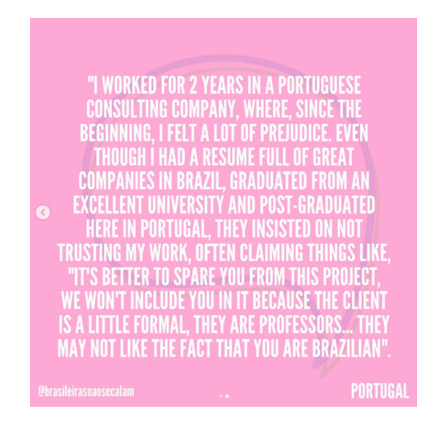
Figure 8 Instagram post @brasileirasnaosecalam