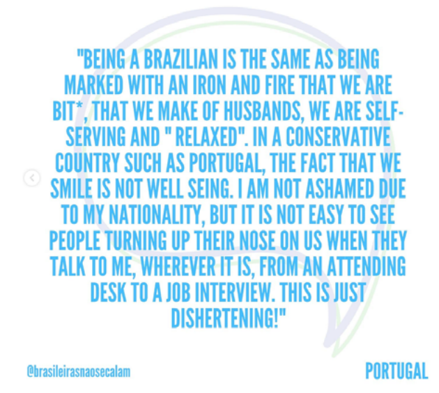
Figure 7 Instagram post @brasileirasnaosecalam