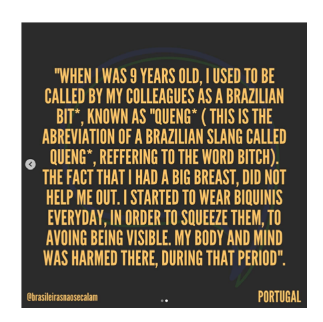
Figure 2 Instagram post @brasileirasnaosecalam