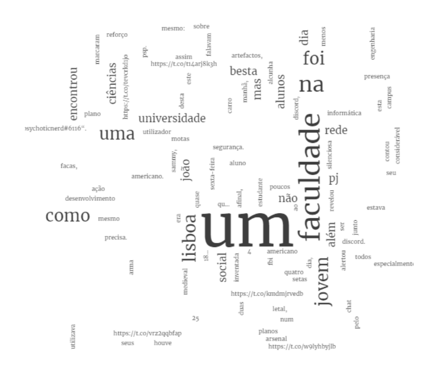
Figure 4 Word cloud of 11 tweets from Expresso

Note. "Lisboa" = "Lisbon", "jovem" = "young man", "foi" = "was", "uma" = "a"; ("Lisbon", "young man", "was", or "a"; "encontrou" = "found", "besta" = "crossbow", "pj" = "JP", and "rede" = "web".