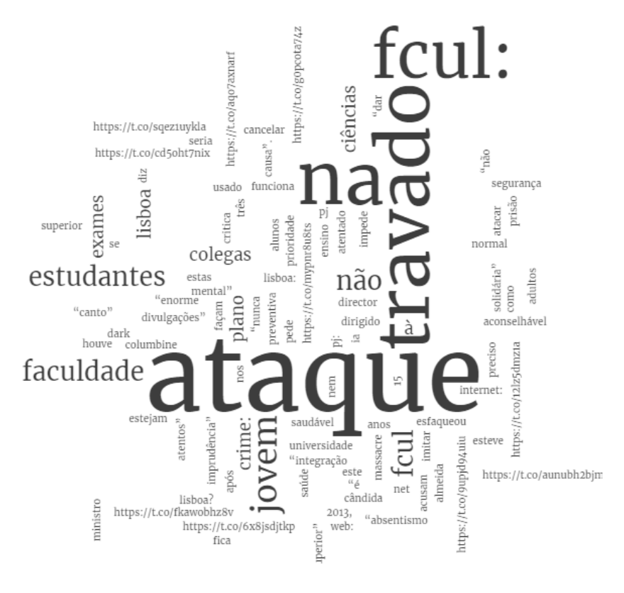
Figure 3 Word cloud of 13 tweets from Público

Note. "Jovem" = "young man"; "faculdade" = "faculty", "estudantes" = "students", "não" = "no", "exames" = "exames", "ciências" = "sciences" or "plano" = "plan".