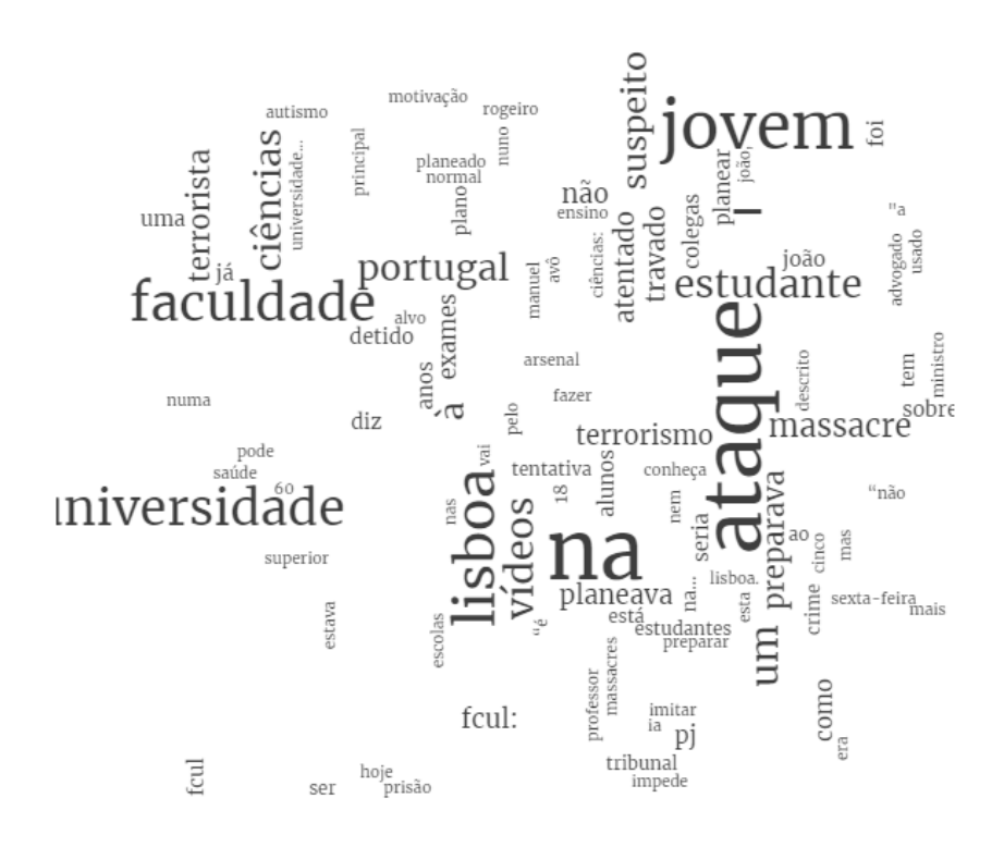
Figure 1 Word cloud of the corpus of 104 tweets

Note. "Ataque" = "Attack", "jovem" = "young man"; "universidade" = "university"; "lisboa" = "Lisbon"; "faculdade" = "faculty"; "vídeos" = "vídeos", "suspeito" = "suspect", "ciências" = "sciences"; "portugal" = "Portugal"; "estudante" = "student"; "terrorista" = "terrorista"; "atentado" = "bombing"; "terrorismo" = "terrorismo"; "massacre" = "massacre"; "preparava" = "prepared"; "planeava" = "planned".