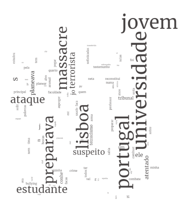
Figure 6 Word cloud of 33 tweets from Correio da Manhã