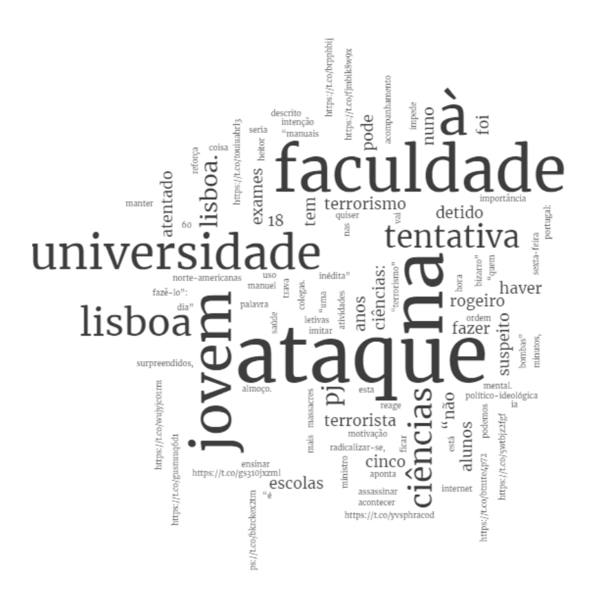
Figure 2 Word cloud of 29 tweets from SIC Noticias

Note. "Ataque" = "attack"; "faculdade" = "faculty", "jovem" = "young man", "universidade" = "university", and "lisboa" = "Lisbon"; "tentative" = "attempt"; "ciências" = "sciences"; "suspeito" = "suspect"; "detido" = "detained".