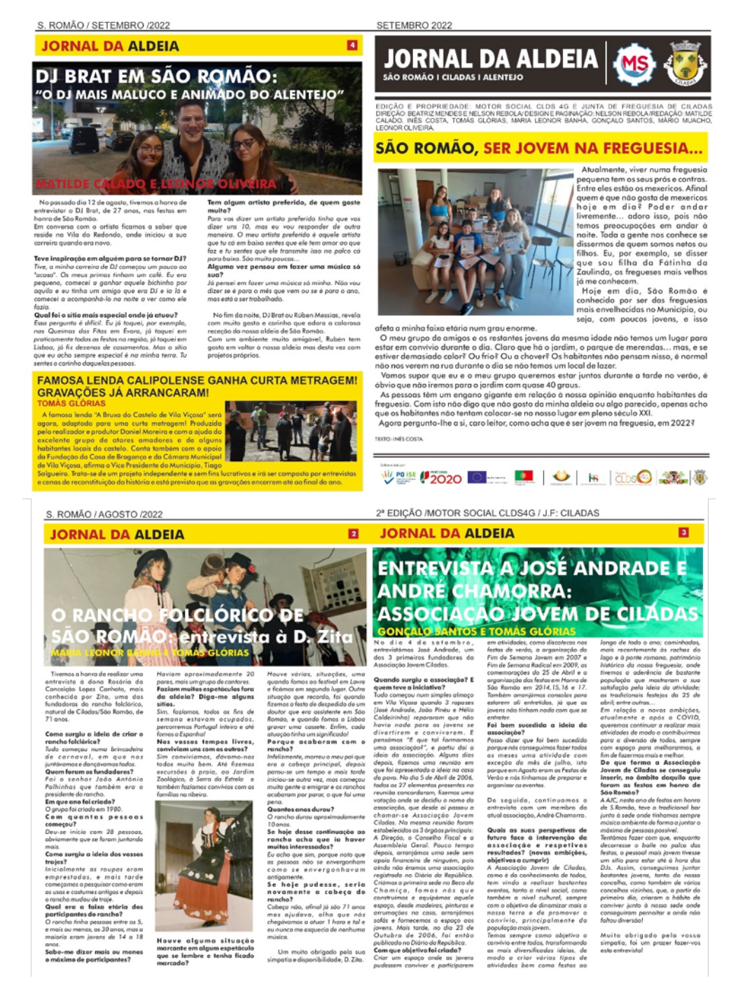
Figure 2. Format and content organisation of Jornal da Aldeia Note. Copies collected by the authors.

Vela Notícias, established for over two decades, was initially spearheaded by a group of young people from Vela in collaboration with the parish priest. The entire community is encouraged to contribute, offering opinion pieces, informative articles, chronicles, poems, and more. Topics are allocated based on each contributor's expertise. For instance, the parish priest curates the "Religião" (Religion) section, while the artistic collective Gambozinos e Peobardos (Vela's theatre group) covers "Cultura" (Culture). The physicians working at the village medical centre provide health advice in the "Medicina"