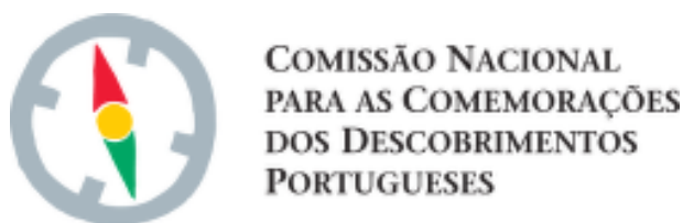
Fig. 1: CNCDP logo. 3

However, perhaps the most challenging of his ideas were, at that time, still being reflected upon during those late afternoons, from where, even today, I find it difficult to get out.