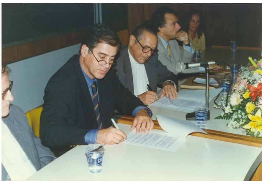
Fig. 4: Creation of the Padre Antônio Vieira Chair in the auditorium of the RDC, PUC-Rio. 1994.