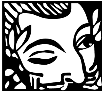
Fig. 3: Logo of the Instituto Camões (IC). 14