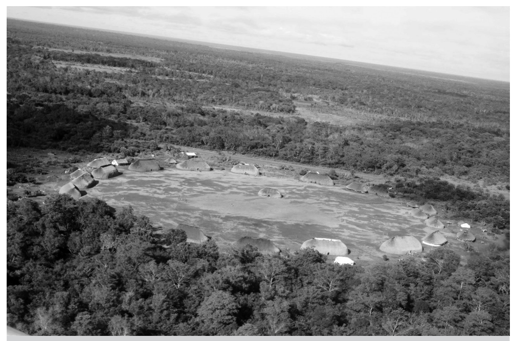
Figure 3 – Aiha Village, February 2015.

of the woods, where one can only walk) of what the road would be in the future. But it was only in mid-2018, after a series of discussions and meetings involving all the people of TIX, that the road was finally made official and completed.