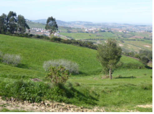
Fig. 2 – Common land in the civil parish of Carvoeira and Carmões Civil Parish Union (left) and in the civil parish of Turcifal (right). Colour figure available online.