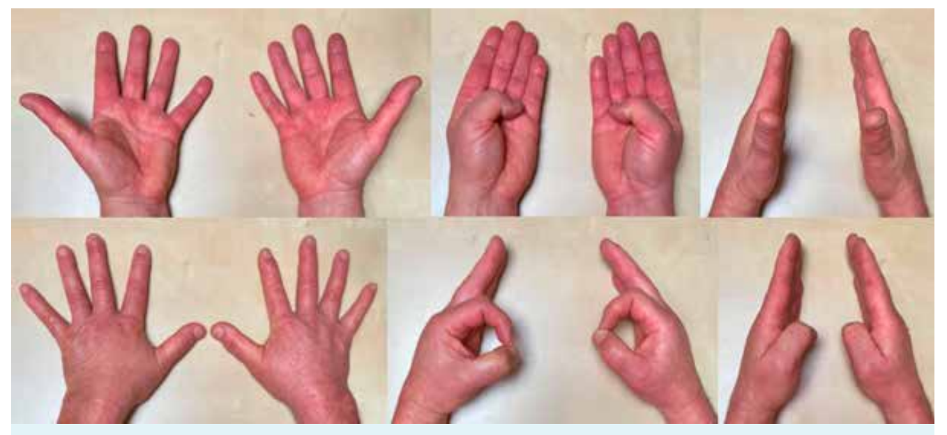
FIGURE 3. Follow-up at 2 months, following conservative treatment with short-arm thumb spica for six weeks: range of motion of both hands.