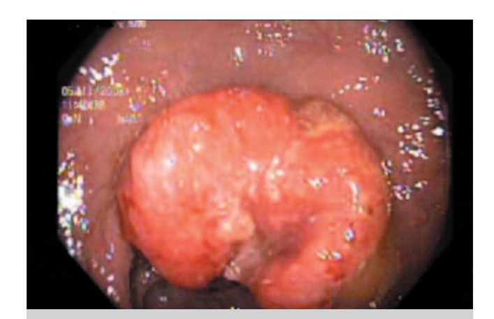
Fig. 4. Colonoscopy: Exophytic tumor growth at 30 cm.

For the increasing lumbar pain, a bone scan was performed which showed heterogenous fixation on the lumbar vertebrae. A repeat CT scan of the lumbar spine was also done, revealing a pathological fracture of the 2nd lumbar (L2) vertebral body. There was an osteolytic lesion with a soft tissue component that merged with the large retroperitoneal lymphadenopathies. Palliative radiotherapy was given (30 Gy in 10 fractions), including L2 and nearby lymphadenopathies.