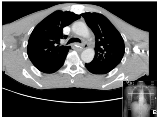
Figure 1 Chest computed tomography images. Horizontal view demonstrated the high-density foreign body lying transversely in the mid-esophagus. The ingested foreign body was about 2 cm in size. There was an abscess with 2 cm long at this level, with no evidence of mediastinitis.