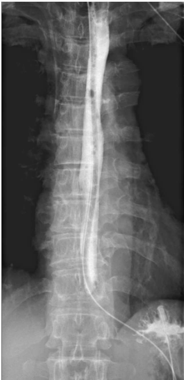
Figure 3 Control esophagogram revealed a small contained leak, with no evidence of mediastinic extravasation.

confined to the mediastinum, drainage of the cavity back into the esophagus, clinical stability, and minimal clinical signs of sepsis. 10,11 Perforation of the cervical esophagus can be managed conservatively in most cases, as well as, perforations of the intrathoracic esophagus that are confined to the mediastinum 12 ; however, perforations of the lower two thirds of the esophagus that affect the pleura, pericardium, or peritoneum require rapid surgical intervention. Choosing an endoscopic therapy for an esophageal perforation requires differentiating between acute and chronic cases. Currently, endoscopic clips are the only devices available for closure of perforations, as suturing and stapling devices are