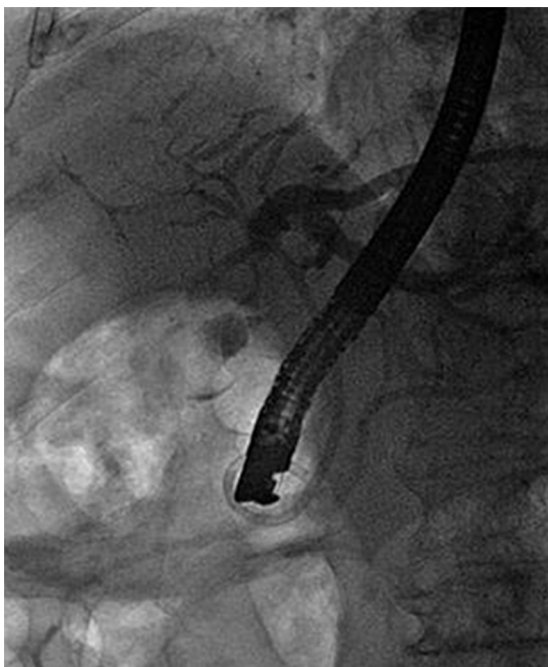
Figure 2 ERCP: internal stenting.

We performed an endoscopic retrograde cholangiopancreatography (ERCP) that clearly showed common hepatic duct compression by a large gallstone (20 mm) impacted in the cystic duct (Fig. 1), compatible with the diagnosis of Mirizzi syndrome. Successful biliary decompression was performed by internal stenting (Fig. 2) with subsequent patient referral to surgery (cholecystectomy plus closure of the fistula).