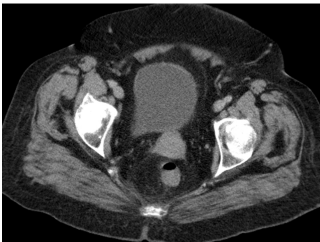
Figure 3 Computed tomography image showing increased densification of the right side of the Perirectal fat.

Confidentiality of data. The authors declare that they have followed the protocols of their work center on the publication of patient data.