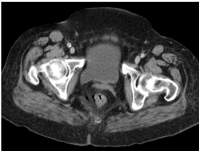
Figure 2 Computed tomography image showing perirectal air adjacent to the right rectal wall, suggesting perforation.