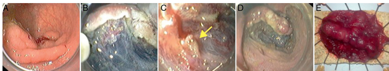
Figure 2 ESD in rectal lesion. (A) Lateral spreading tumor, mixed granular type, with coarse nodular areas (T0-IIa+Is) in the proximal rectum; (B) submucosal dissection using the Dual Knife; (C) penetrating vessel with minimal bleeding (arrow) controlled with hemostatic forceps; (D) advanced stage of the procedure with about 3/4 submucosal dissected; (E) piece stretched with 52 mm × 35 mm, whose histology shown tubulovillous adenoma with high-grade dysplasia (R0).

There were three cases of minor bleeding: two during the procedure and controlled endoscopically and one