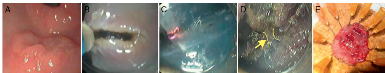
Figure 1 Gastric ESD. (A) Superficial lesion in the gastric antrum with 25 mm (T0-IIc+IIa); (B) mucosal incision with the Dual Knife to get access into the submucosal layer; (C) dissection of the submucosal fibers with the It-Knife 2; (D) dissection of the last submucosal fibers (arrow). (E) piece stretched with 33 mm × 27 mm, revealing a well differentiated intramucosal adenocarcinoma (T1a) with ulcerative component completely excised (R0).