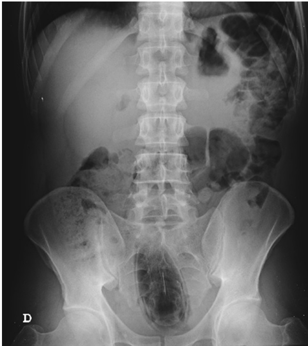
Figure 1 Foreign body in the small pelvis.

case, as there was previous drug consumption, a situation of body packing could not be totally excluded. In a prior review concerning drug packets ingestion, endoscopic removal is referred as a therapeutic option and is a reasonable alternative to surgery in particular situations. 4 However, there is no evidence if this approach can be applied in suspected rectal retention of drug packers. Once the patient and the guards denied any possession of drugs, and given the clinical stability and the radiological findings, endoscopic removal was decided, keeping the patient without sedation. However we performed a second look, as it is mandatory after an anorectal foreign body removal to exclude bowel injury and