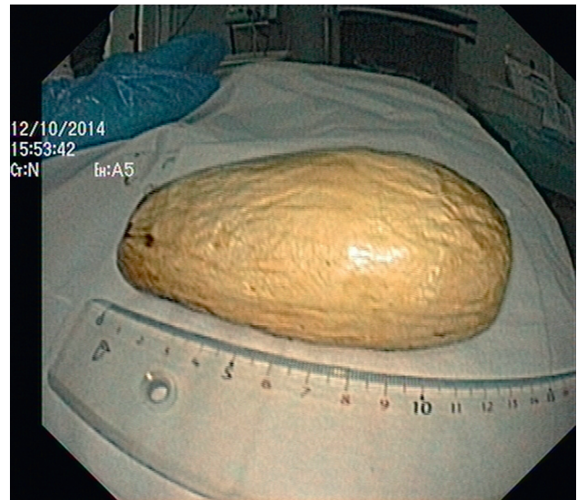
Figure 3 Foreign body after removal.