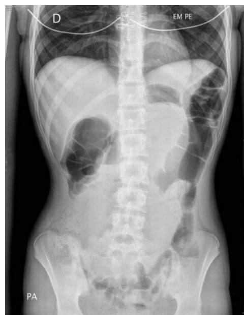
Figure 1 Abdominal radiograph. Marked gastric distension with gastric camera barely visible.

Given the large mass causing gastric outlet obstruction and compression of neighboring structures it was decided to undergo laparotomy. Through the gastrotomy, a gastric