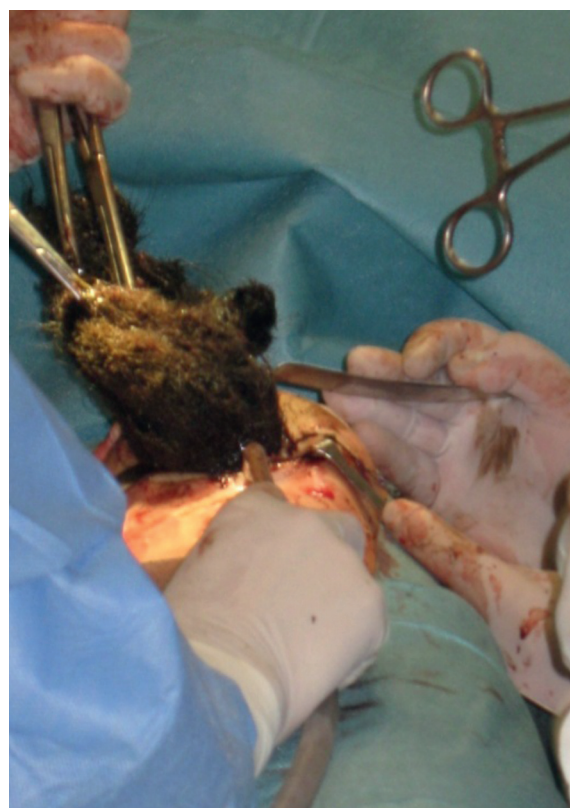
Figure 6 Gastrotomy and extraction of the trichobezoar 15-cm-long.