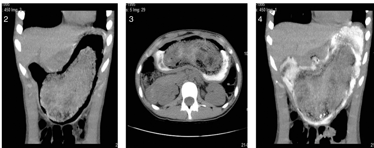
Figures 2, 3 and 4 Abdominal tomography scan. Bulky bezoar difficult to characterize, occupying almost the entire gastric lumen and conditioning compression of neighboring structures.

trichobezoar 15-cm-long was removed (Fig. 6). The post-operative course was uneventful with resolution of the gastrointestinal symptoms.