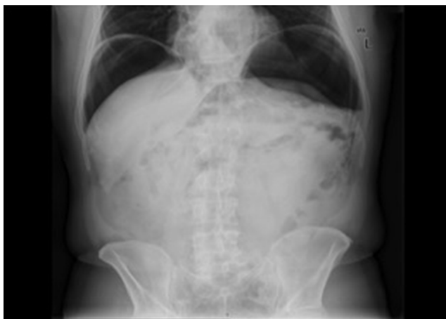
Figure 3 Plain Abdominal radiography documenting pneumoperitoneum after the iatrogenic perforation diagnosed during endoscopic mucosal resection and successfully treated with clips.

Comparing the endoscopic (n = 10, G1) versus surgical (n = 21, G2) approaches: