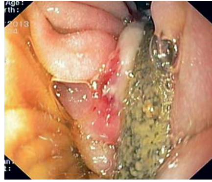
Fig. 1. Endoscopy showing the catheter inducing an ulceration between the second and third duodenal portions.

After multidisciplinary discussion (surgery, radiology, neurology, and gastroenterology) regarding the complexity of a surgical solution and the stability of the patient's clinical status, a wait-and-see attitude was decided. The patient was maintained on oral levodopa/carbidopa. PEG was removed and the proximal tip of the jejunal tube was cut. Two days after this procedure, complete anal exteriorization of the jejunal tube spontaneously occurred, without any clinical adverse events.