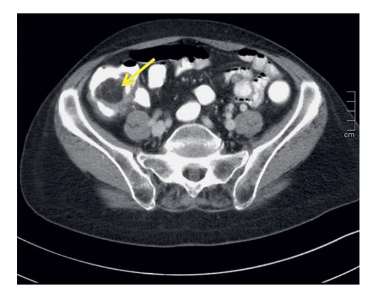
Fig. 1. Abdominal computed tomography showed a 4-cm hypodense lobulated lesion, with an eccentric solid component, in the ascending colon.

A 78-year-old female was referred to a gastroenterology appointment due to recurrent lower abdominal pain, anorexia, and significant (~10%) weight loss over the last 3 months. Abdominal computed tomography (CT) showed a 4-cm hypodense lobulated lesion, with an eccentric solid component, in the ascending colon (Fig. 1). In colonoscopy, a large broad-based ulcerated mass, with necrotic and fatty tissue exposed in the ulcerated area, was documented in the ascending colon (Fig. 2a, b). First, this lesion was misinterpreted as an ulcerated and necrotic colonic adenocarcinoma, but biopsies were negative for malignancy. Colonoscopy was repeated and the hypothesis of a large ulcerated colonic lipoma was considered.