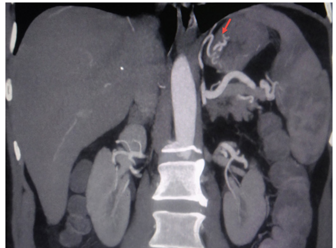
Fig. 2. CT angiography (abdomen): an arterial plexus crowded in the gastric fundus.

area protruding into the stomach, chances of repeat massive bleeding were anticipated. He was referred to the interventional radiology department where embolization of the arterial plexus was done.