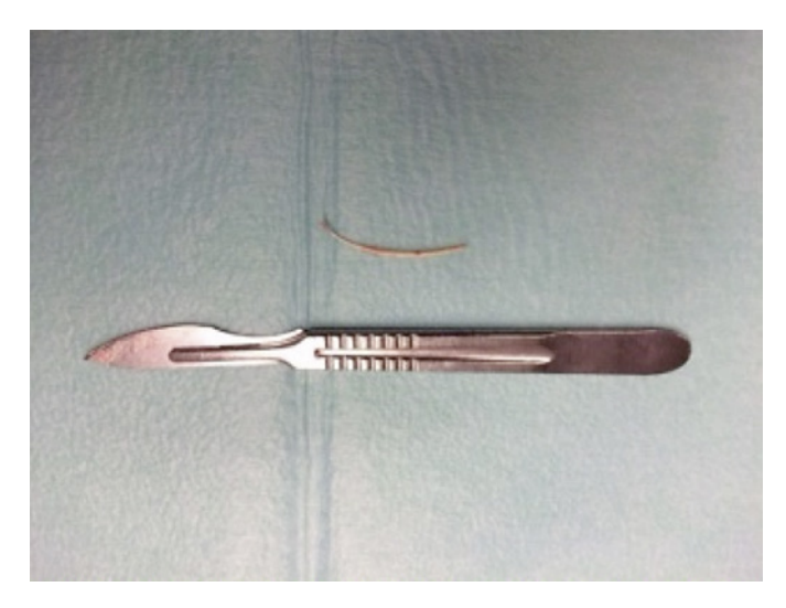
Fig. 4. Fish bone removed surgically.

Eikenella corrodens is a fastidious facultative anaerobic gram-negative bacillus that is part of the commensal microbiota of the mouth, upper respiratory tract, gastrointestinal and genitourinary mucosal surfaces. Eikenella infections are generally indolent in course and can mimic an anaerobic process due to the induction of foul-smelling suppuration [1, 17]. It needs incubation in an atmosphere rich in CO_2 for recovery in culture and has a predilection for causing endocarditis [1]. Eikenella grows slowly, normally taking 2 days or more to be recognized [1]. In fact, in our case, we could witness that the isolation and identification of this organism occurred after 5 days,