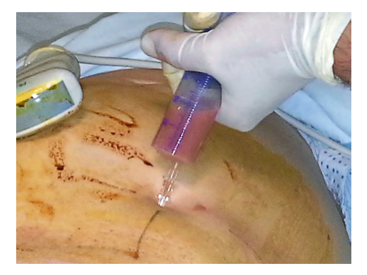
Fig. 3. Ultrasound-guided percutaneous drainage of the abscess.

S. anginosus sensitive to penicillin was isolated in two blood cultures and in the pus drained from the liver abscess. Moreover, E. corrodens was isolated also in one blood culture. An echocardiogram excluded infective endocarditis. The patient was treated for