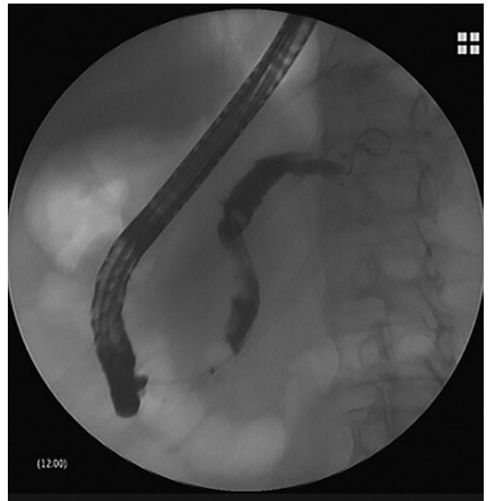
Fig. 3. Fluoroscopic image after contrast instillation with diffuse MPD dilation.

Biopsies using SpyBite™ forceps were performed in the different MPD segments (at least 3 samples per segment). SpyBite™ was passed along the accessory channel of the scope after removal of the wire. We usually lubricate the forceps using silicone spray to facilitate the passage. The