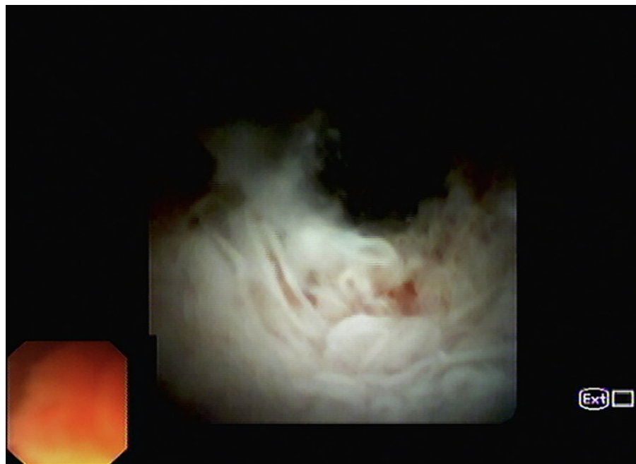
Fig. 4. Pancreatotomy image showing the presence of mucin in the head and neck of the pancreas, papillary fronds, and protrusions with a “fish-egg” appearance.

sions were observed in the biopsies performed in the body and tail region. The patient was submitted to a subtotal duodenopancreatectomy. Surgical specimen histology confirmed the previously reported findings and associated presence of a focal ductal adenocarcinoma, with 15 mm of extension (pT1bN0R0). The patient remains well 1 year after surgery, with no evidence of disease recurrence in the follow-up.