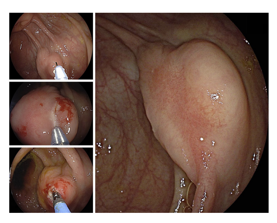
Fig. 3. At the revision colonoscopy, a 10mm linear incision created by needleknife<sup>®</sup>, over the highest convexity of the lesion, exposed the target-lesion at the deeper layers. Lesion tissue sampling was obtained using a standard biopsy forceps through the SINK technique.

An Atypical Presentation of a Colonic Lipoma