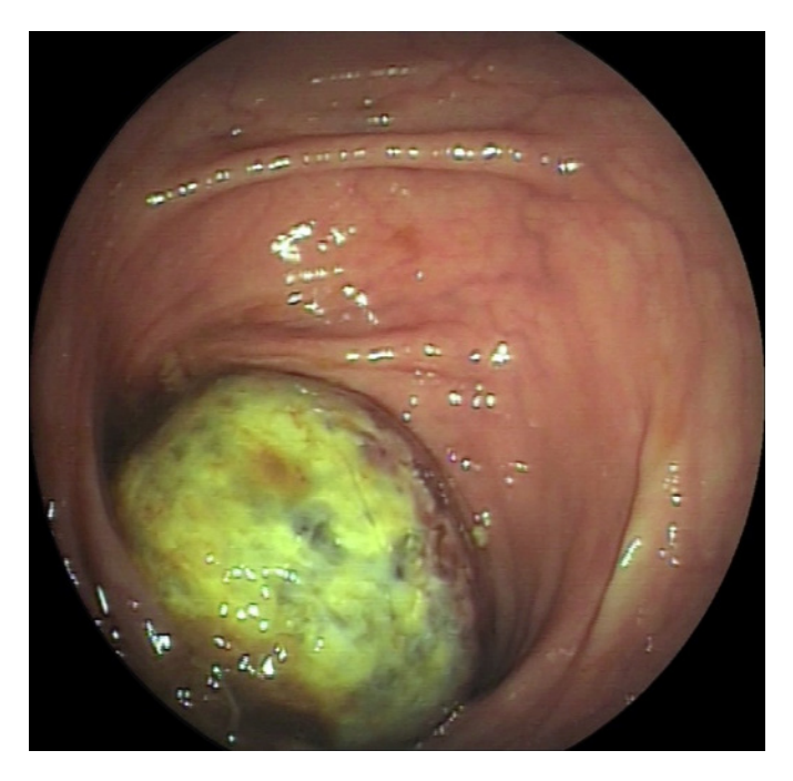
Fig. 1. Initial colonoscopy showing a 30–35-mm polypoid lesion with necrotic and ulcerated areas occupying three quarters of the lumen of the proximal ascending colon.