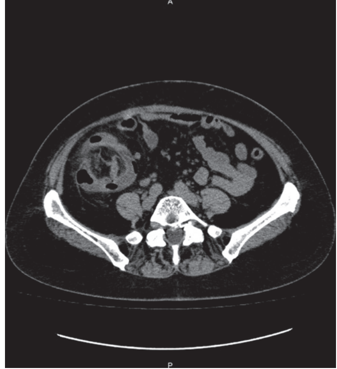
Fig. 2. Abdominopelvic computed tomography scan with intravenous contrast (axial section) demonstrating a ceco-colonic intussusception with invaginated mesenteric fat and vessels.