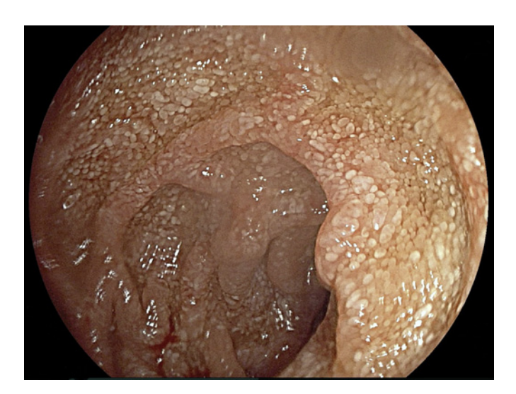
Fig. 2. Upper gastrointestinal endoscopy revealing whitish small plaques diffusely distributed in the intestinal mucosa of the second portion of the duodenum.

capsule endoscopy (Given Imaging Ltd., Yoqneam, Israel) was performed revealing the entire mucosa of the small bowel diffusely edematous with prominent whitish spots (Fig. 1a–c). These endoscopic features led to the suspicion of Whipple disease. To confirm the diagnosis, the patient underwent upper gastrointestinal endoscopy in our institution with duodenal biopsies (Fig. 2). Histopathological examination revealed ectatic lymph vessels in lamina propria and multiple periodic acid-Schiff positive macrophages (Fig. 3a, b). Polymerase chain reaction testing for Tropheryma whipplei DNA was positive. The patient was admitted and started antibiotic treatment with ceftriaxone 2 g intravenous once daily for 2 weeks followed by trimethoprim-sulfa-