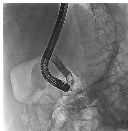
Fig. 1. Occlusion cholangiogram showing no contrast passage through the proximal end of the previously placed uncovered metal stent.

We present a case of a 65-year-old female patient, diagnosed with adenocarcinoma of the pancreatic head with liver metastasis. She underwent ERCP for biliary drainage using an uncovered self-expandable metal stent (SEMS; 6 cm × 10 mm, WallFlex™ Biliary RX Uncovered, Boston Scientific, Marlborough, MA, USA), followed by palliative chemotherapy. Eighteen months after the first procedure the patient presented to the emergency department where she was diagnosed with cholangitis and was admitted with IV antibiotics. A second ERCP was scheduled where the